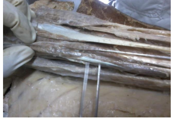
Fig. 4: Palmaris longus with 2 muscle bellies

Digastric palmaris longus muscle with a single tendon: Intermediate tendon with two muscle bellies-Upper and Lower. There are present in the upper half of the forearm. In the lower half of forearm the Palmaris longus tendon was normal and in the palm the formation of aponeurosis was noted (Fig. 4).