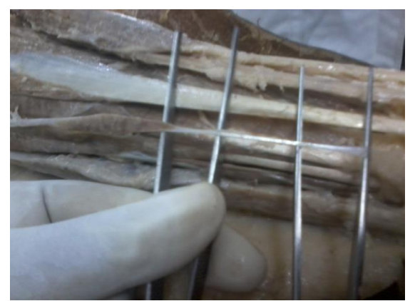
Fig. 3: Slender rounded Palmaris longus tendon

Slender rounded palmaris longus tendon: Thread like, slender rounded Palmaris longus tendon was observed in 2 cases. Muscle belly was very slender and Short (Fig. 3).