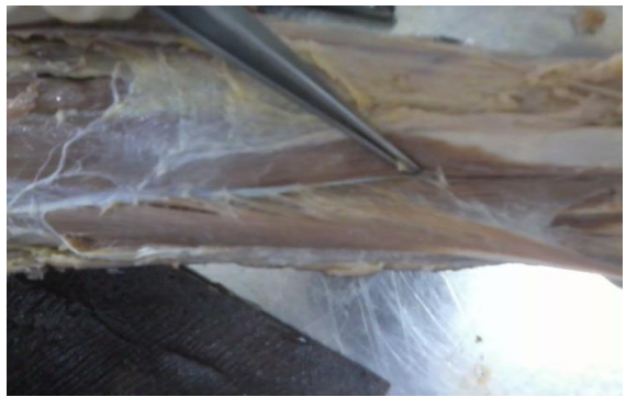
Fig. 5: Fusion of palmaris longus muscle belly with the flexor digitorum superficialis muscle

Fusion of palmaris longus muscle belly with the flexor digitorum superficialis muscle: The muscle belly of Palmaris longus fused with the muscle belly of the flexor digitorum superficialis throughout its entire extent. The picture shows that the Palmaris longus muscle is split open from the flexor digitorum superficialis (Fig. 5).