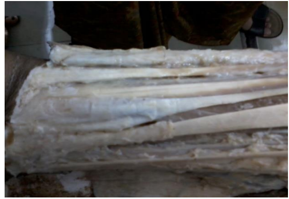
Fig. 2: High aponeurosis of the Palmaris longus muscle

This type of variation of Palmaris longus tendon expansion in the forearm has not been reported so far.