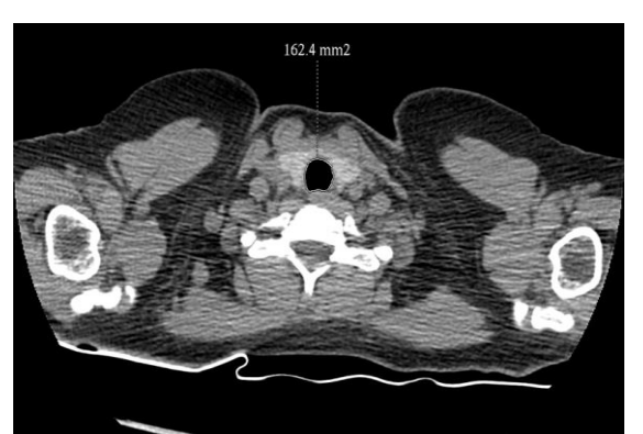
Fig. 3: Measurement of cross sectional area of the trachea

Statistical analysis: Quantitative variables were expressed as mean \pm 2 standard deviation (2SD) of the mean. The minimum and maximum values in study population were established for each parameter. The relationship of all study parameters i.e. A-P and Transverse diameter of trachea, length of trachea, cross sectional area and volume of trachea with height and weight of patient was assessed using Pearson's correlation. The regression analysis of significantly correlating variables was done with height and weight as predictors. The R<sup>2</sup> values were calculated and significance was taken at 'p' < 0.05. The null hypothesis of no difference in each of the study parameter between male and female population was tested using 't' test. Statistical significance was defined as 'p' value < 0.05. Statistical Package for Social Sciences (SPSS) 16 was used for statistical analysis.