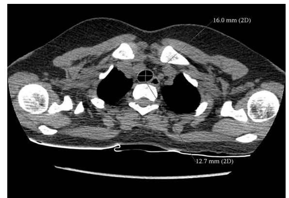
Fig. 1: Measurement of the A-P & transverse diameter

Cross-sectional area ( CSA ): was measured at 10 different axial slices cranio-caudally along the length of the trachea and then averaged. The cross-sectional area of the airway (in square millimetres) was obtained by hand tracing the inner wall of the airway with an electronic tracing tool of the DICOM software ( Fig. 3 ). Tracheal volume : was calculated by multiplying length by mean cross-sectional area. The mean corrected cross-sectional area, derived from all slices except those showing the lateral flare just above the tracheal bifurcation and those through the region of variable narrowing just below the cords, was multiplied by the corrected length of the trachea<sup>3</sup>.