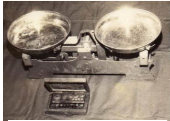
Fig. 1: Ordinary weighing balance (sensitive to 0.5gm)

The limiting points of calculated range (Mean ±3SD) as Demarking point (DP) for each measurement which covered the 99.75% of the samples. These Demarking points (DP) provides reasonable accuracy in identifying the sex of the hip bones.<sup>[1]</sup>