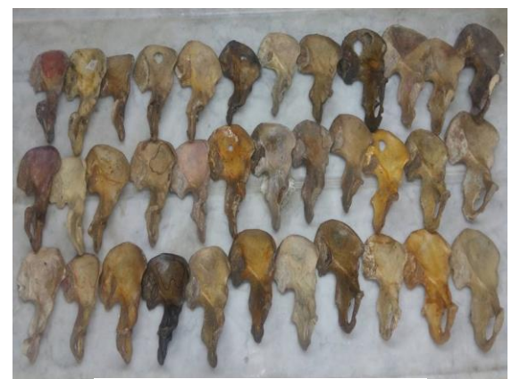
Fig. 9: Female left hip bones (35)