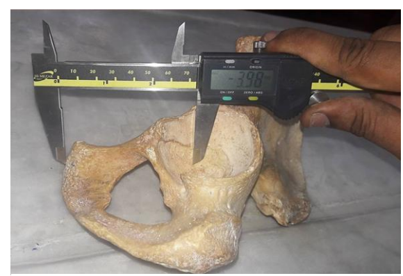
Fig. 5: Length of pubis: (OM) maximum distance between the morphological centre of the acetabulum & pubis measured with sliding caliper