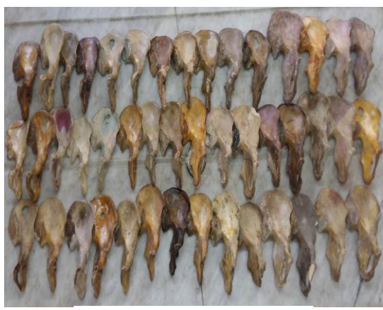
Fig. 8: Male left hip bones (45)