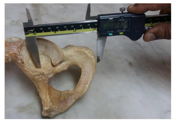
Fig. 6: Length of ischium: (ON) maximum distance between the morphological centre of the acetabulum & ischium measured with sliding caliper