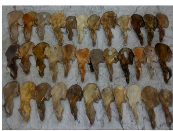
Fig. 10: Female right hip bones (35)