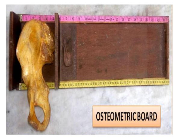
Fig. 4: Measurement of breadth of the hip bone (CD)