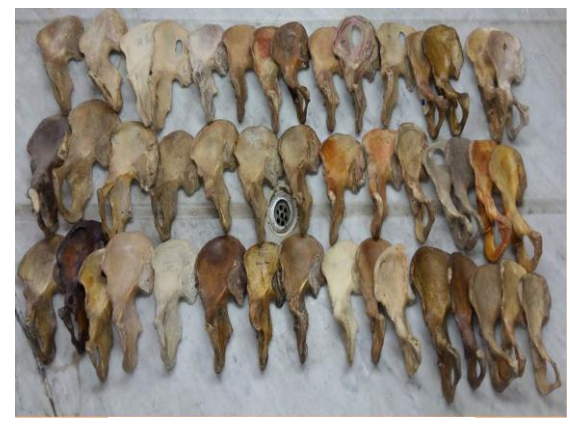
Fig. 7: Male right hip bones (45)