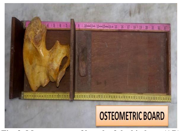
Fig. 3: Measurement of length of the hip bone (AB)