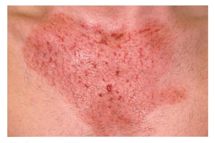
Figure 2: Acute irritant contact dermatitis

exposure <sup>8</sup>. The symptoms are similar to acute ICD, and the prognosis is good. It is important to have knowledge of this subtype as the delayed nature of the dermatitis may lead the clinician to misinterpret the eruption as ACD.