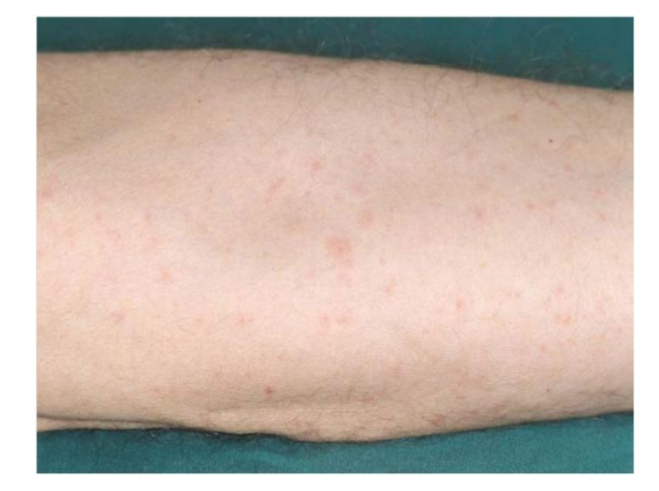
Figure 1: Glass fiber dermatitis- Severe itchy small papules on the forearms