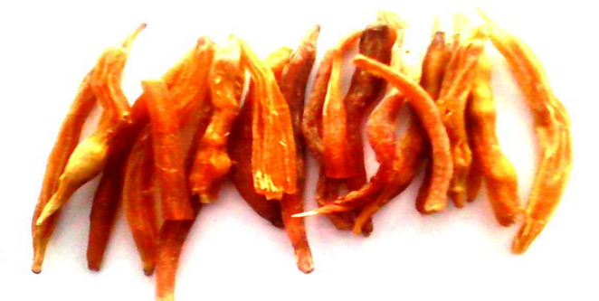
Figure 1: Root of Asparagus racemosus Willd.

immediately outside the endodermis comprises thick walled cells, with the numerous oval or circular pits on their walls. Endodermis is composed of a single layer of compactely arranged, barrel-shaped parenchymatous cells. Inner to endodermis is a single layer of thin walled, parenchymatous cells constituting the pericycle in the form of ring, which surrounds a central stele. Phloem and xylem groups many in number, are arranged on alternate radii and form of a ring. Vessel elements possess spiral, scalariform and pitted thickening.