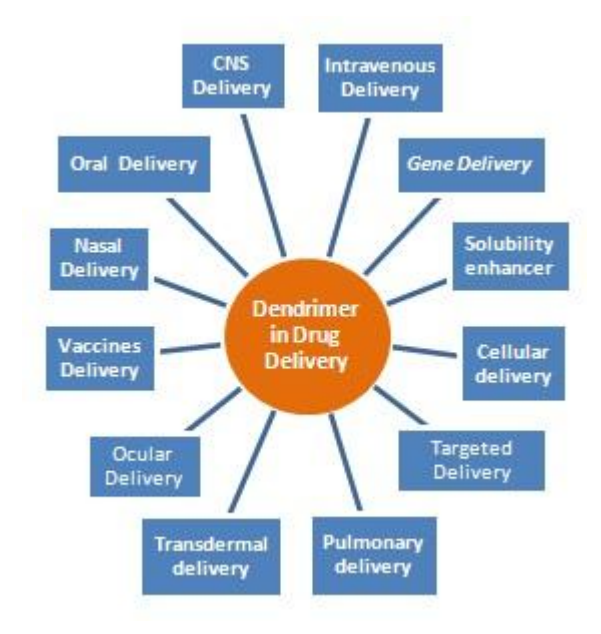
Figure 3: Various application of dendrimers in drug delivery

size and shape of drug or imaging-agent cargo-space; (ii) biocompatibility, non-toxic polymer/pendant functionality; (iii) precise, nanoscale-container and/or scaffolding properties with high drug-loading capacity; (iv) well-defined scaffolding and/or surface modifiable functionality for cell specific targeting moieties; (v) lack of immunogenicity; (vi) appropriate cellular adhesion and internalization, (vii) adequate bioelimination or biodegradation; (viii) controlled or stimuli-responsive drug release features; (ix) molecular level isolation and protection of the drug against inactivation during transit to target cells; (x) minimal non-specific cellular and blood—protein binding properties; (xi) ease of consistent, reproducible, clinical grade synthesis.