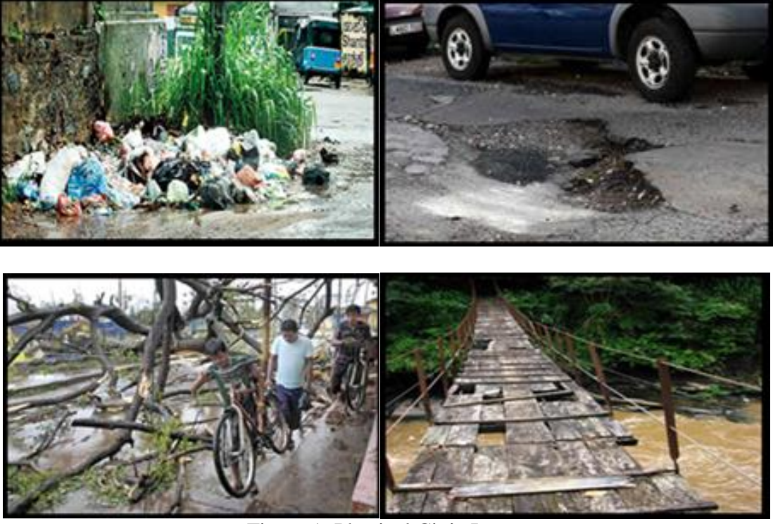
Figure 1: Physical Civic Issues

Figure 1 shows some physical civic issues prevailing in the country.