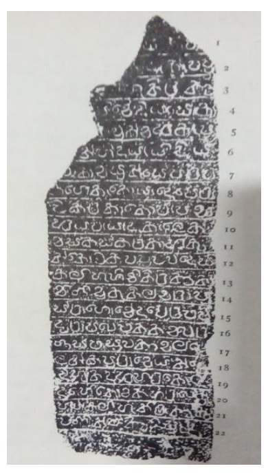
Figure 3.2: Estampageage of Nissankamalla's Inscription found in Polonnaruwa

The identification of the ancient character set in selected time period and identification of each character variations and styles become more predominant part in this research.