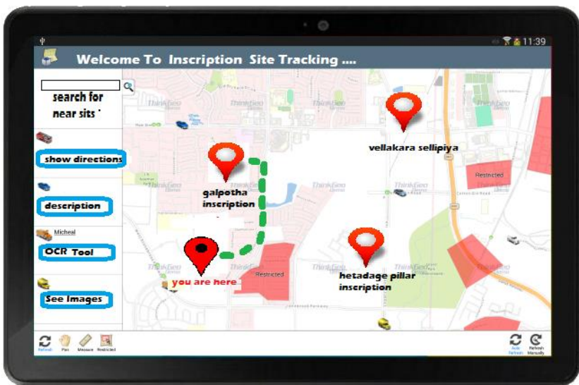
Figure 3.6: Designed Interface of Inscription Site Tracking

This module will present a map that user can go around easily by tracking the locations of inscriptions. The 2D map provides detailed information about the different inscription sites. This is a kind of a regional geographical map which shows where the inscriptions are located in selected era of our research. This component will guide the archaeology researchers who visit ancient ruins. Given figure 3.6 shows the main interface of the designed prototype of the responsive web application to be developed.