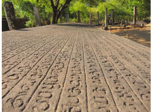
Figure 1.1: Polonnaruwa Galpotha (Stone Book) Inscription.

There are many Inscriptions found in ancient cities of Anuradhapura and Polonnaruwa in Sri Lanka. Thonigala inscription, Galpotha (Stone Book) inscription (see Fig. 1.1), Mirror wall are some of them.