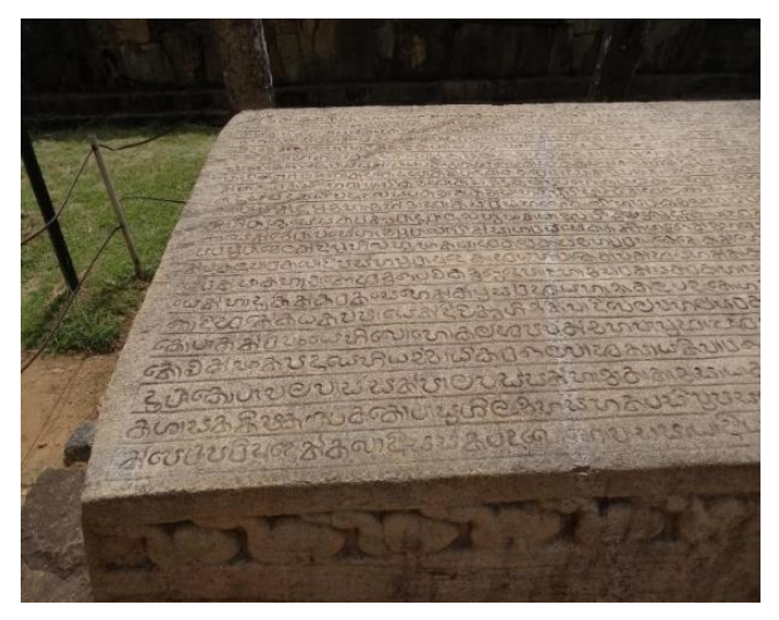
Figure 3.1: Original photograph of Galpotha inscription

Following Figure [3.1] shows one of the original image data used for our research project and Figure [3.2] shows the estampages 'image of Nissankamalla's Inscription found in Polonnaruwa.