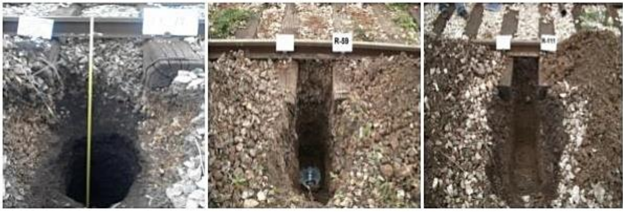
Figure 2: Characteristic trial pits along the research section of the railway route, corridor V.

Materials that build an embankment along the vertical, ie superstructure and foundation of the railway, were established in exploratory trial pits, figure 2, and have characteristics given in the table 2 [5,6,7,8].