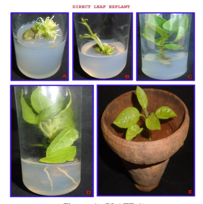
Figures 1: (PLATE-1)