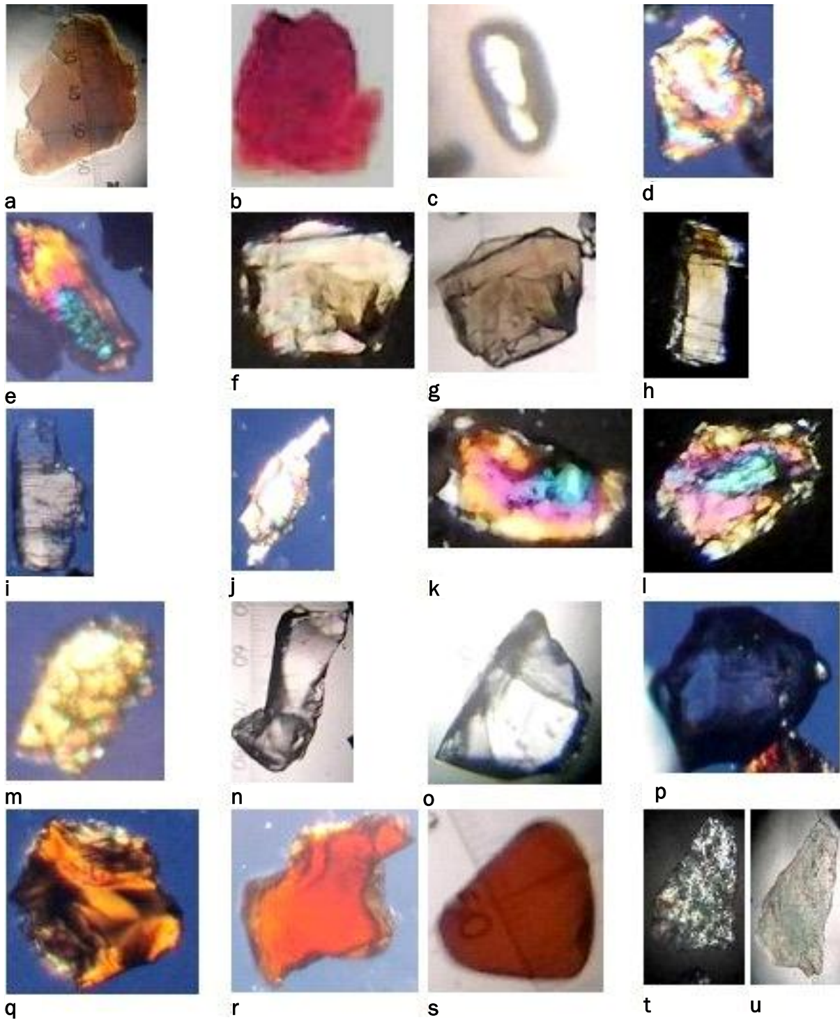
Figure 2 | Photomicrographs of heavy minerals of Gondwana sandstones, a, chlorite, b, biotite, c-e, zircon, f, g, tour-