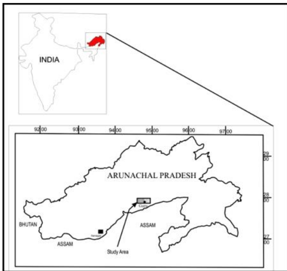
Figure 1a | Location map of the study area.

The Gondwana Group of rocks of the study area representing the northernmost rift system of Gondwanic India bear signatures of marine transgressions in Sakmarian times. The area under study is located in the districts of East Siang and West Siang of the state of Arunachal Pradesh (Fig. 1a). The north dipping Gondwana sequence is sandwiched between the Miri Group in the hanging wall of the Miri Thrust (MT) in the north and Lower Siwalik Dafla Formation in the footwall of the Main Boundary Thrust (MBT) in the south (Fig. 1b). The Bichom Formation represented by diamictite, orthoquartzite, khaki shale, grey shale, shaly coal, coal, carbonaceous shale, siltstone, sandstone, concretions with marine fossils. The sandstone is medium to coarse grained, thinly laminated and highly cross stratified at places. It is grey to reddish brown in colour. Carbonaceous streaks are distributed throughout the rock and this character varies