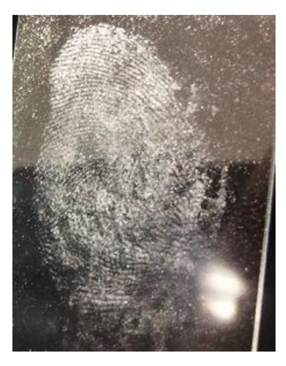
Fig 12: Visualization of latent fingerprints on microscope slide using Durian seeds powder