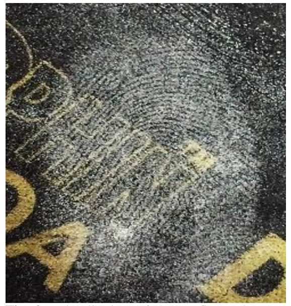
Fig 2: Visualization of latent fingerprints on Carbon paper using Durian seeds powder

The results of the latent fingerprint development using durian seeds powder on eleven different surfaces are shown in figures below. Latent fingerprints present on majority of the surfaces examined can be successfully developed with Durian seeds powder.