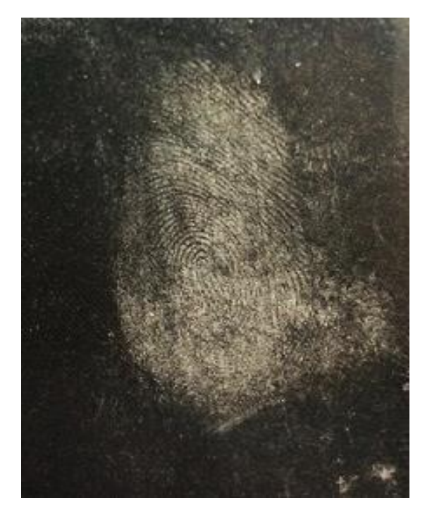
Fig 10: Visualization of latent fingerprints on translucent sheet using Durian seeds powder