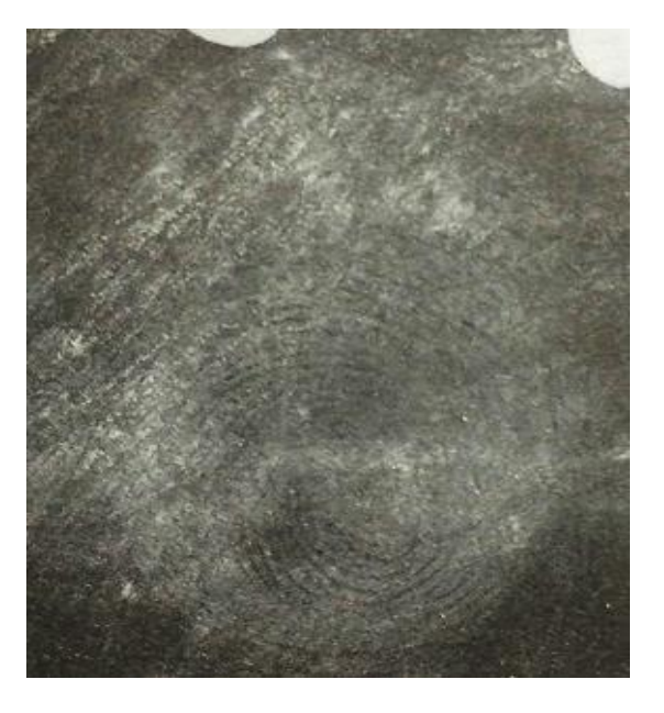
Fig 6: Visualization of latent fingerprints on paper using Durian seeds powder