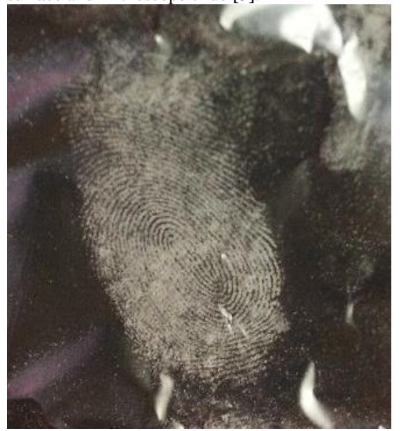
Fig 1: Visualization of latent fingerprints Aluminium foil using Durian seeds powder

In this research, different types of surfaces were used to compare the clarity of fingerprint using Durian seeds powder. Both porous and non-porous surfaces were employed in the research. The surfaces included were aluminium sheet, carbon paper, writing surfaces of CD, mirror, painted steel, newspaper, petri dish, plastic bottle, surfaces of water bath(steel), transparency sheet, wooden surface and microscope slide [3].