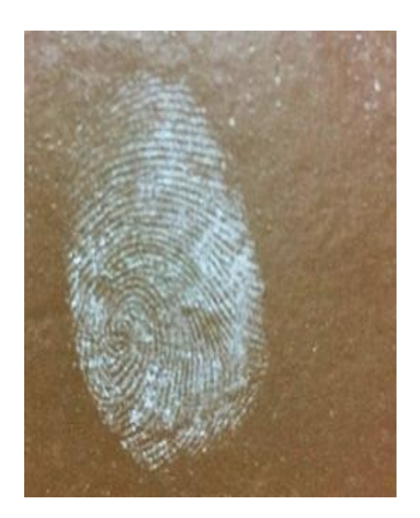
Fig 11: Visualization of latent fingerprints on wooden surface using Durian seeds powder