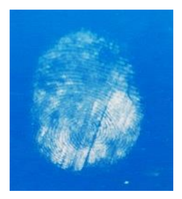
Fig 5: Visualization of latent fingerprints on painted steel using Durian seeds powder