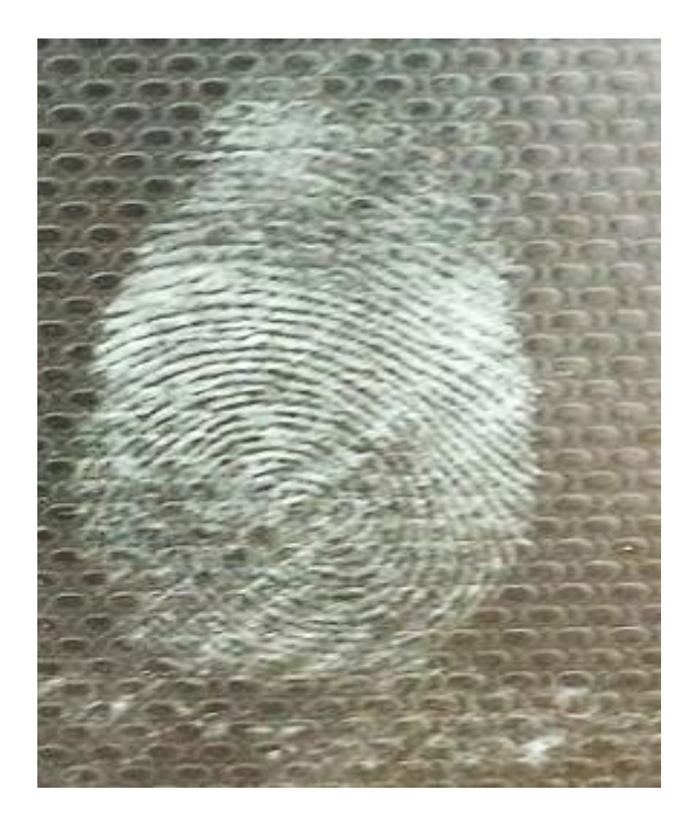
Fig 9: Visualization of latent fingerprints on steel using Durian seeds powder