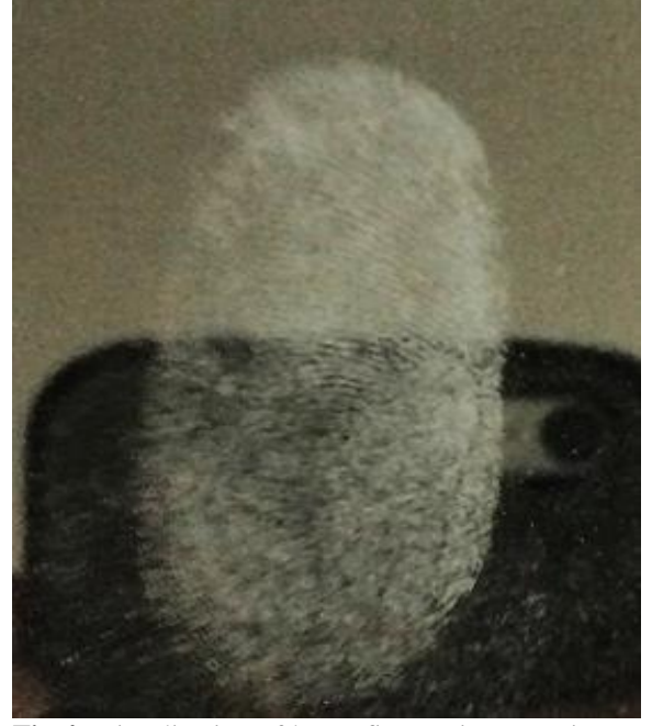
Fig 4: Visualization of latent fingerprints on mirror using Durian seeds powder