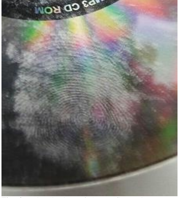
Fig 3: Visualization of latent fingerprints on written surface of CD using Durian seeds powder