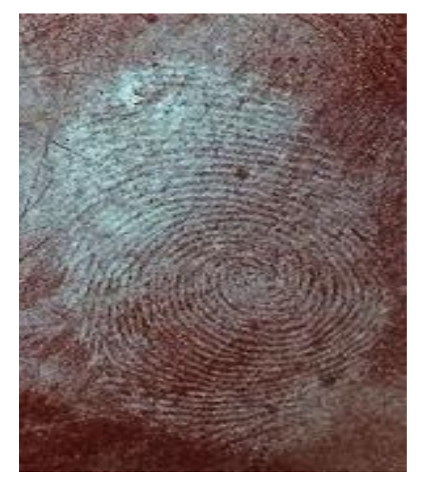
Fig 7: Visualization of latent fingerprints on petri dish using Durian seeds powder