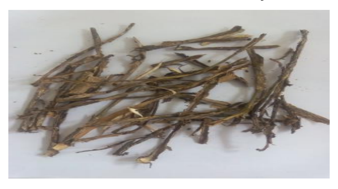
Plate – 1 Photograph of bark of Carrisa carandas

The colour of the pieces of bark was dark brown externally and light brown internally. The odour and taste was characteristic. Fracture was smooth and texture of bark was rough.