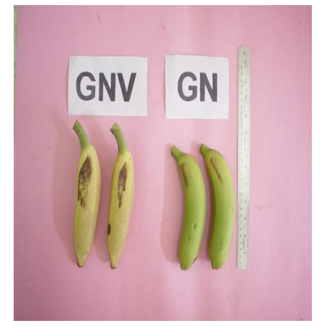
Figure 4 : Ripened fingers of field identified normal and variant (GNV-04) 'Grand Naine' banana