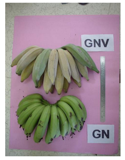
Figure 3: Ripened hands of field identified normal and variant (GNV-04) 'Grand Naine' banana