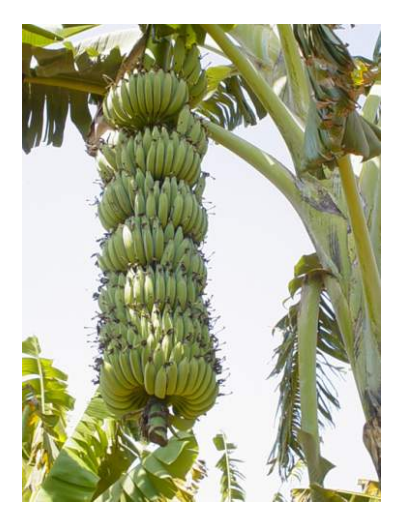
Figure 1: Matured bunch of field identified variant (GNV-04).