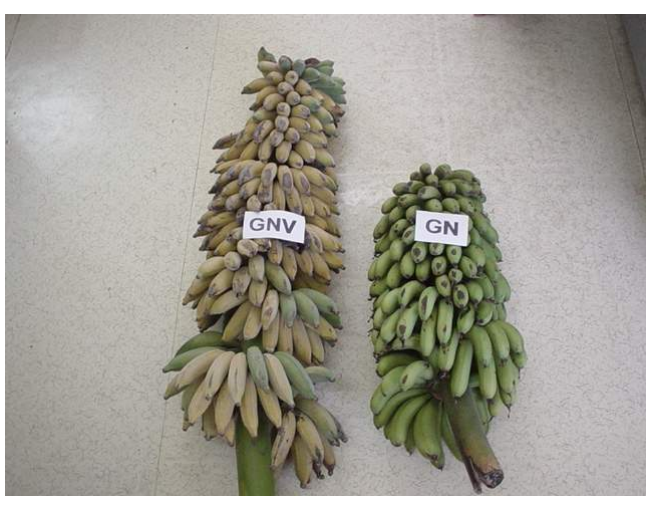
Figure 2: Ripened bunches of field identified normal and variant (GNV-04) 'Grand Naine' banana.