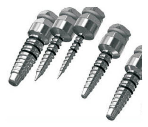
Fig 1 Tapered screw bone expanders