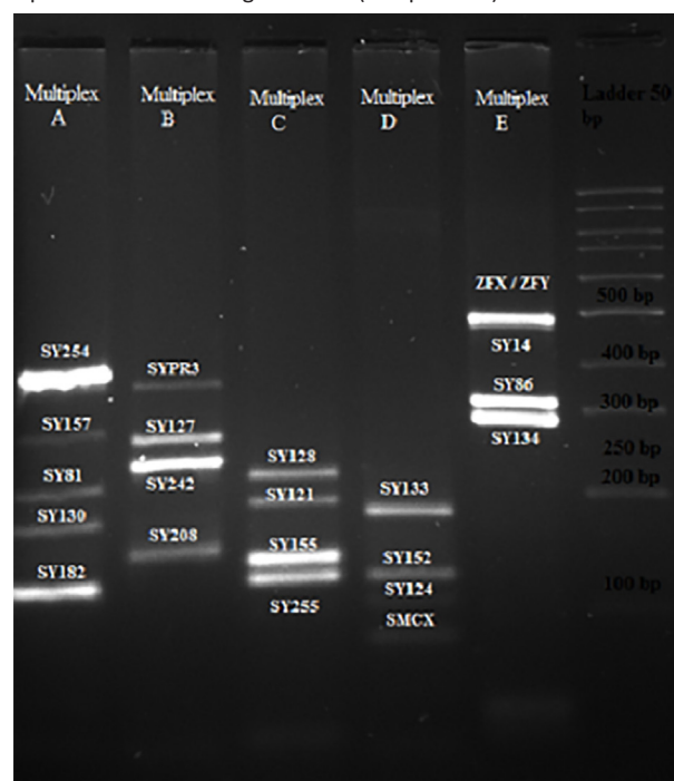
Fig.2: Results of the multiplex A, B, C, D and E in control group. Polymerase chain reaction (PCR) fragments were separated on a 3.5% agarose gel. Lane 1; Multiplex A, Lane 2; Multiplex B, Lane 3; Multiplex C, Lane 4; Multiplex D, and Lane 5; Multiplex E. Molecular weight marker (50 bp ladder).