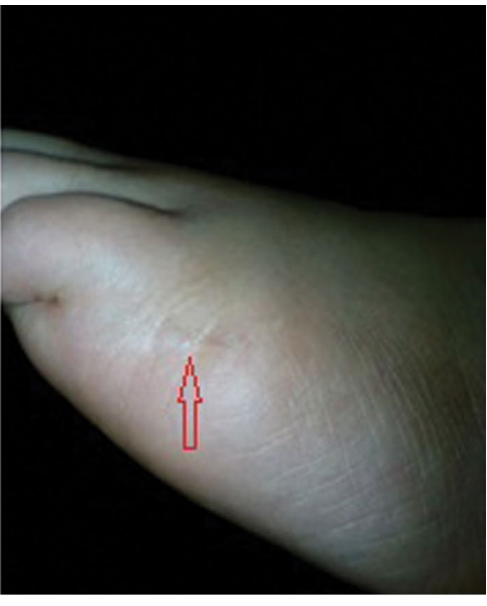
Fig.1: The patient had undergone surgery for correcting the postaxial polydactyly at the age of one. The above photograph was taken with the consent of the parents of patient at the Noor Genetics Laboratory.