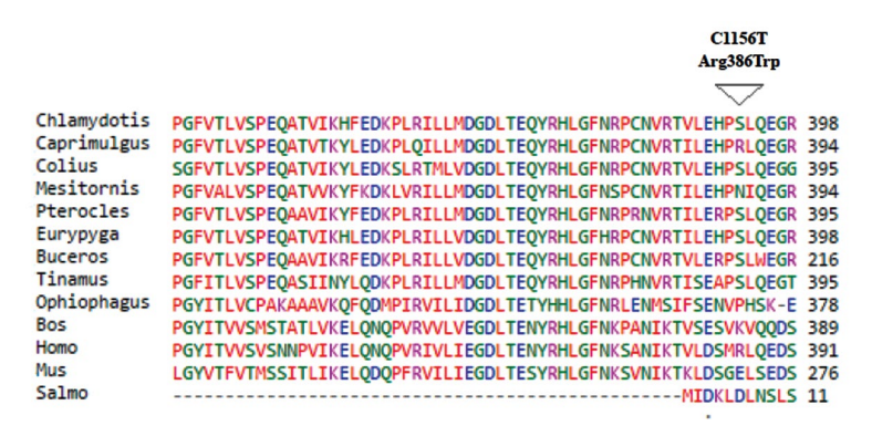
Fig.2: Sequence alignment of BBS12 of several species showing the conserved position of Leu19 and the non-conserved Arg386.