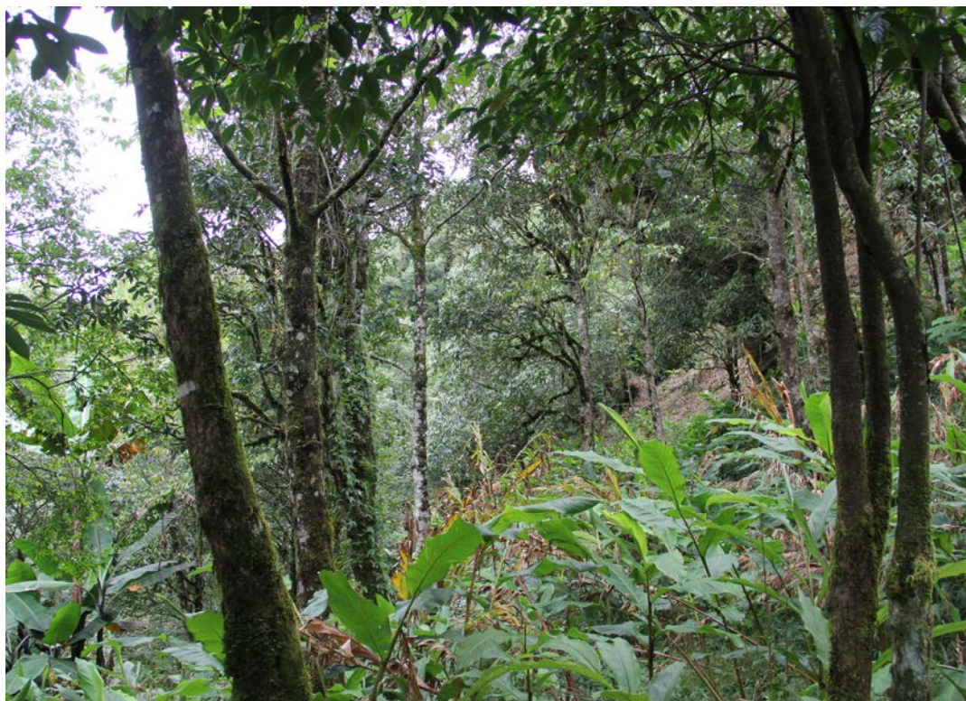
Figure 3 Habitat of Japalura chapaensis in Lvchun, southeastern Yunnan Province, China

For the remaining mainland congeners from non-Himalayan regions, J. chapaensis differs from J. fasciata by having a longer tail (TAL >204% SVL vs. <180%) and longer hind limbs (HLL >74% SVL vs. <69%), and by the absence of a transverse hourglass-shaped marking on the dorsum (vs. present); from J. batangensis , J. brevicauda , J. dymondi , J. flaviceps , J. grahami , J. iadina , J. laeiventris , J. splendida , J. vela , J. yulongensis , and J. zhaoermii by having significantly enlarged nuchal crest scales (vs. not significantly differentiated from dorsal crest scales), bright yellow oral cavity (vs. flash color or blackish blue), and by the absence of a transverse gular fold (vs. present); from J. varcoae by having a concealed tympanum (vs. exposed) and enlarged, differentiated nuchal crest scales (vs. not significantly differentiated); and from J. micangshanensis by having significantly enlarged nuchal crest scales (vs. not significantly differentiated from dorsal crest scales) and by the presence of gular spots (vs. absent).