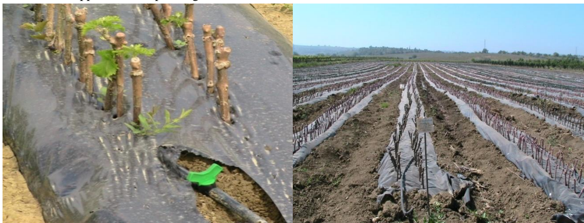
Figure 1: The grapevine nursery and mulched plots.

The sapling was done inserting 2/3 of grafted cuttings into the soil through the holes (Figure 1). A similar procedure was followed for NM plots. Considering the nutritional status of the nursery soil, sufficient amount of fertilizers were applied before planting.