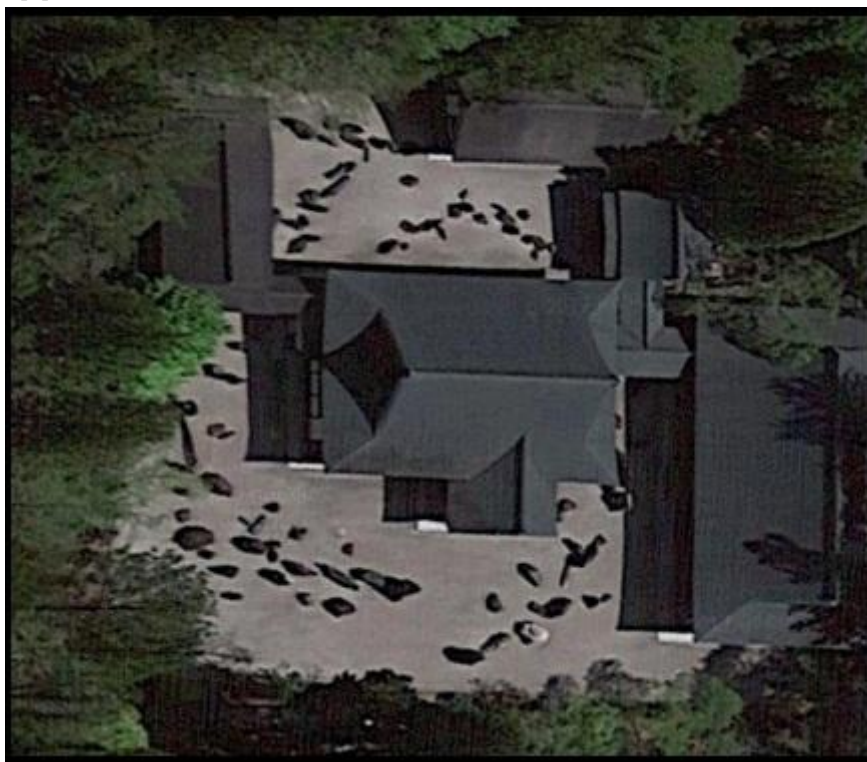
Figure 1: Banryutei Rock Garden “Spiral Dragon” forms

general, however, Japanese have preferred asymmetrical, natural shapes to representational or fanciful ones, and have placed more emphasis upon the integration of rocks into the composition than upon the uniqueness of individual rocks [3].