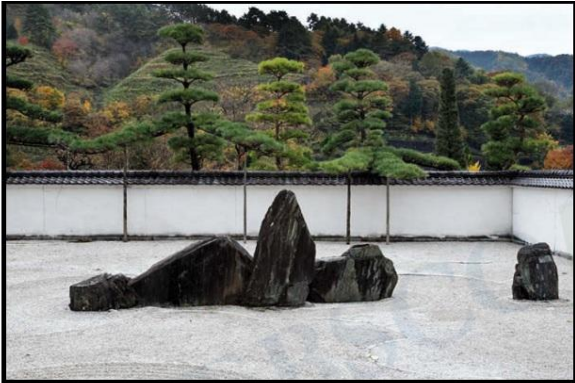
Figure 2: Five rock composition in a rock garden [5]

Gravel and sand is often used in a traditional dry landscape garden, but it was almost always of a light gray color as seen in figure 2, with the most commonly used type being the famous Shirakawa suna. In 20 th century famous Japanese landscape architect Mirei Shigemori used different shades of gravel for the first time. It has been accepted as renewal and modern form of Japanese rock garden art [5].