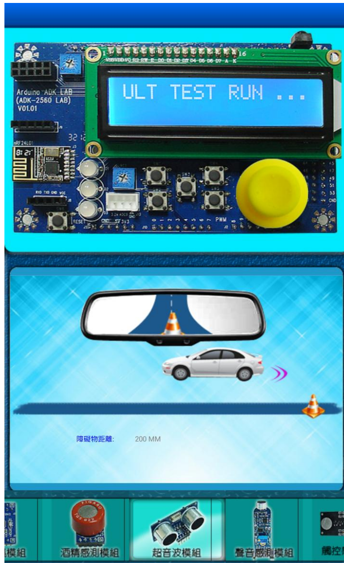
Figure 4: The ultrasound data are shown in mobile phone