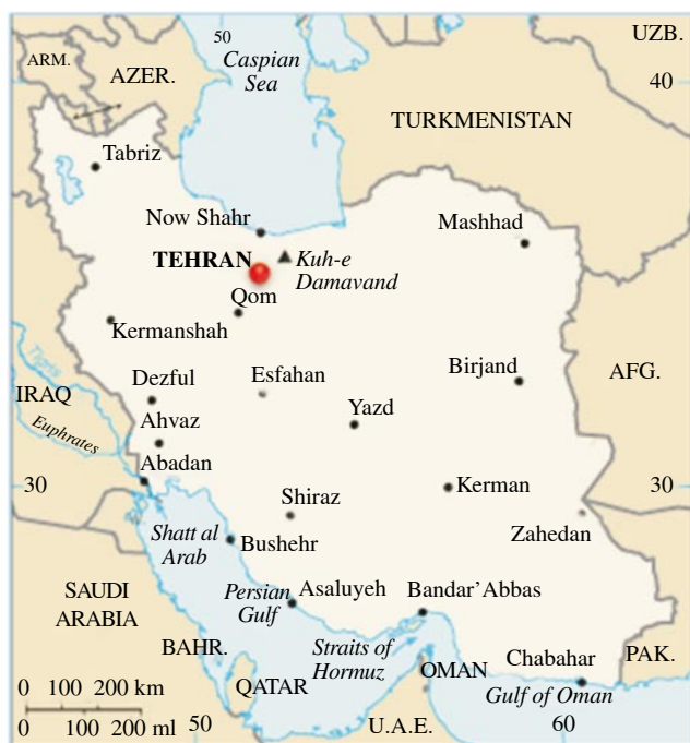
Figure 1. Map of study area.

ditches which act as main breeding places for Cx. pipiens complex.