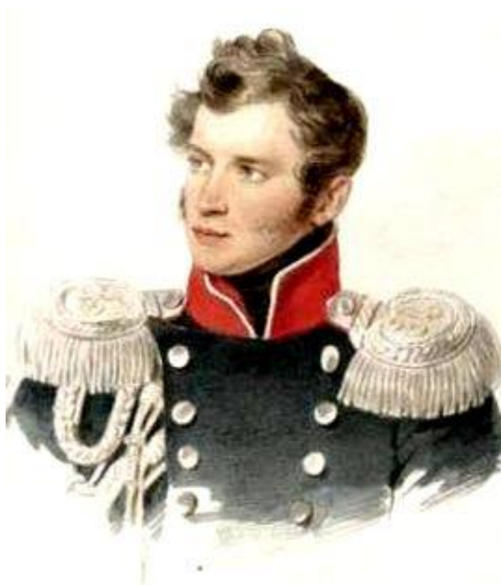
Fig. 1. Aleksandr Grigorievic Stroganov 8

As for important proceedings regarding the development of the canal during the 1830s, one should admit that the Government Commission of Internal Affairs, Public Enlightenment Affairs and Spiritual Matters indicated in its report for 1838 that, after the completion of the last lock built on the Hańcza River “called Hardwood”, the Augustów Canal was firstly expected to be completely open as an inland waterway the following year. Again in 1839, the Ministry of Internal Affairs intended to submit the so-called channel tariffs for approval by the Administrative Council. Such fees, levied on ships passing through the canal, were to be used to repay in the future the sums “borrowed” by the Bank of Poland for the “completion of that channel”. Additionally, in 1838, Polish administrative authorities completed the processing of claims submitted by local individuals, demanding the payment of compensation for their lands occupied by the state for the construction of the Augustów Canal 9 .