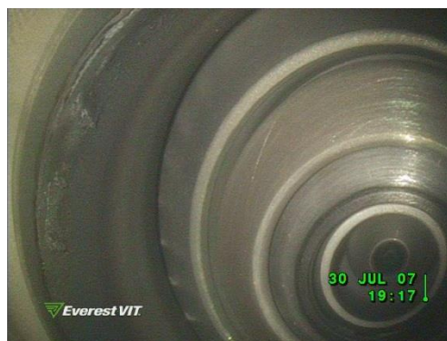
Fig. 4. Minor carboning on the fuel nozzle

Carboning refers to layers of carbon stocked on a material. Fuel nozzles are the parts of the engine where such a phenomenon most often occurs. This is the by-product of a combustion process, which is not often perfect. The area of accumulation is the result of fuel atomization, mixture swirling and low axial flow. Carboning of fuel nozzles is not a cause for rejection, provided it is not excessive. Excessive carboning will affect fuel spaying, which will further result in an uneven fuel/air mixture and stream temperature.