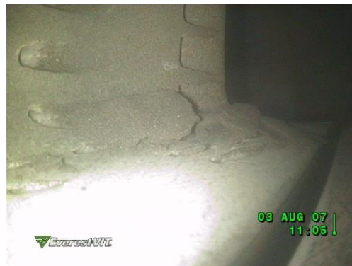
Fig. 6. Chunks of surface coating at the trailing edge of a high-pressure turbine blade

Chipping refers to the breaking away of small pieces under mechanical force, which is quite often an acceptable condition. This will result in local stress concentration due to material discontinuity. Contrary to flaking, chipping has a significant depth.