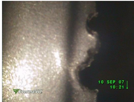
Fig. 7. Dents on a compressor blade's leading edge

A dent is a round-bottomed, smooth and shallow cavity, which results from impact or prolonged constant overload. Material is displaced, but not removed.