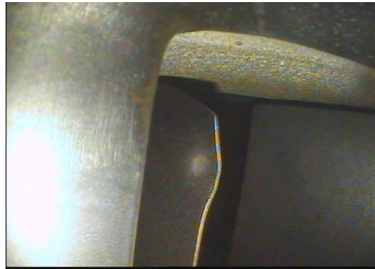
Fig. 2. Low-pressure compressor's trailing edge blade bend.

An object is bent when the angular distortion from the original contour occurs. This damage is typical on leading and trailing edges of engine blades and caused by a lateral force. Such damage poses more danger to airfoil strength values than aerodynamics and, as such, bents are sometimes considered as dents by some manuals. In this scenario, it is to be measured in a lateral not an axial direction. A typical bend often appears on trailing edges as a result of foreign object impact. A large-scale bent in various dimensions is called buckling , which is caused by a foreign object or mechanical or thermal overload. An example of a trailing edge bend, which is to be investigated as a dent, is illustrated below.