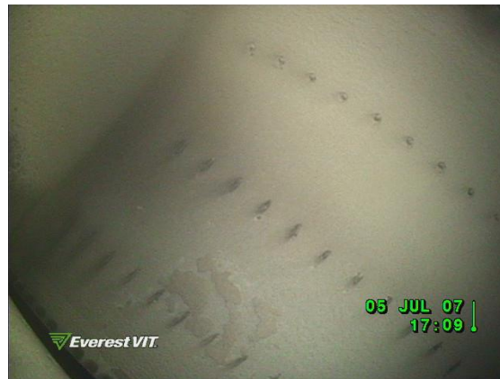
Fig. 8. Coating missing from the high-pressure turbine blade's concave side due to flaking

Foreign object is a common phrase that refers to the situation when there is an element present, which is not an engine part. The object may loosen freely in the respective area or be fixed to or stuck in some way. “FOD” is an abbreviation for foreign object damage, while “DOD” means domestic object damage.