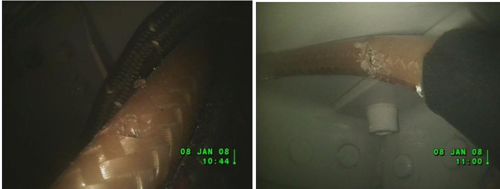
Fig. 5. Chafing between two adjacent cables due to insufficient separation

Chafing is typical description for the abrasion of two adjacent components, if at least one of them moves in a limited area against the other. This effect is often discovered between two tubes or pipes if they are not sufficiently separated from each other.