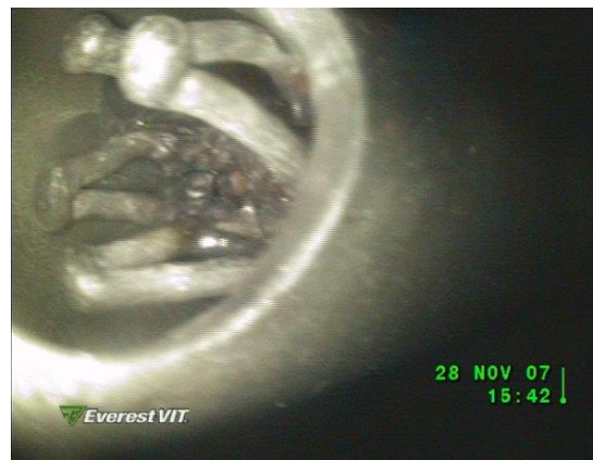
Fig. 3. Chromel-alumel thermocouple junction burnt.

A burn refers to structural damage due to heat influence with no or improper protection, lubrication, clearance and shielding, or uneven temperature spread. It is accompanied by discoloration and, if not corrected, breaks the flow of material, which means the total loss of characteristics.