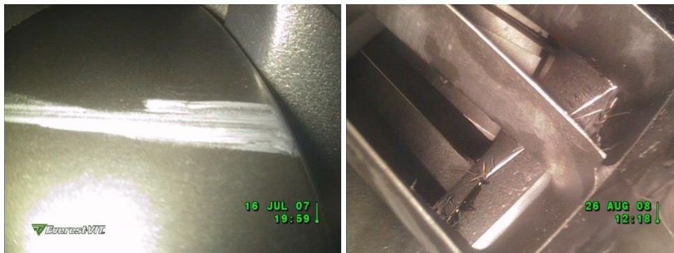
Fig. 1. Evidence of a bird strike

The phenomena described in this article may all be revealed by visual inspection - general or detailed - but it is more important and more difficult to discover a root cause of the symptom being observed. The terms explained below help to precisely define and describe any finding during an inspection. This will make it easy to distinguish one deterioration symptom from another, which in turn will allow for planning the appropriate repair approach, as well as reveal the root cause of phenomenon.