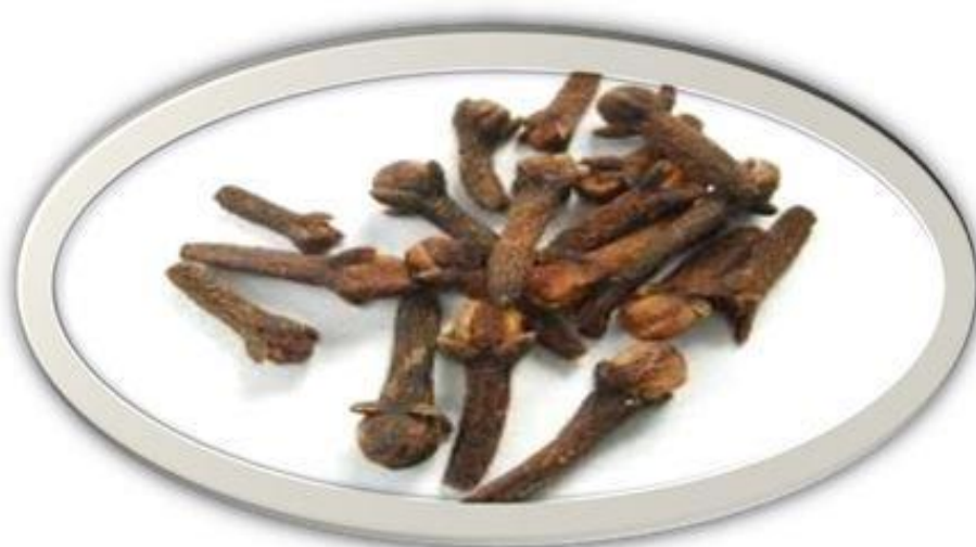
Figure 1. Syzygium aromaticum (Linn) Merr. and Perry.

inhibition zones were measured and averaged. The mean values were tabulated.