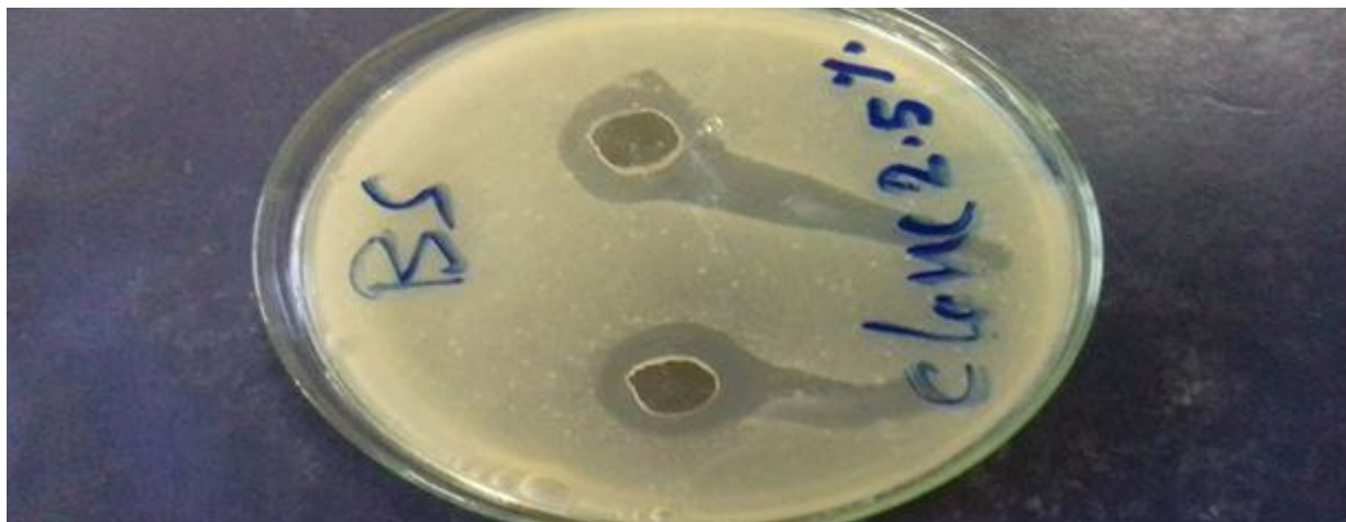
Figure 4. Zones inhibition of antibacterial activity of clove oil ( Syzygium aromaticum ) against Bacillus subtilis by concentration used 2.5%.