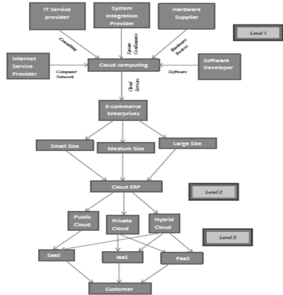
Figure-2 Main Framework of migrating Cloud ERP

As of now Cloud ERP has not been introduced into the E-commerce enterprise but this paper focuses on introducing it into E-commerce SME's many large enterprises can utilize this facility. Initially, most enterprises focused on on-Premise ERP systems which has a few drawbacks of its own hence this ERP system availed the facility of moving into the cloud.