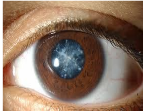
Fig. 2: Diabetic Snow Flake Cataract Discussion

Diabetes is emerging as a major noncommunicable disease responsible for morbidity and mortality worldwide. Diabetes shares the main burden of preventable blindness worldwide. Diabetic retinopathy and cataract are the main causes of visual impairment and blindness among the diabetics.<sup>12</sup> Despite these two being preventable causes of blindness, a significant number of people from developing countries having PDR (Proliferative Diabetic