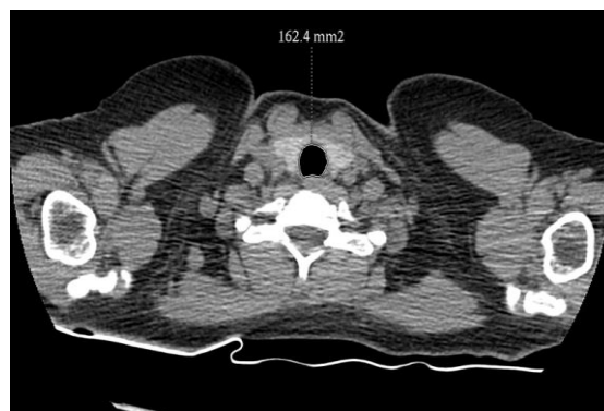
Fig. 3: Measurement of cross sectional area of the trachea

Statistical analysis: Quantitative variables were expressed as mean \pm 2 standard deviation (2SD) of the mean. The minimum and maximum values in study population were established for each parameter. The relationship of all study parameters i.e. A-P and Transverse diameter of trachea, length of trachea, cross sectional area and volume of trachea with height and weight of patient was assessed using Pearson's correlation. The regression analysis of significantly correlating variables was done with height and weight as predictors. The R 2 values were calculated and significance was taken at 'p' < 0.05. The null hypothesis of no difference in each of the study parameter between male and female population was tested using 't' test. Statistical significance was defined as 'p' value < 0.05. Statistical Package for Social Sciences (SPSS) 16 was used for statistical analysis.