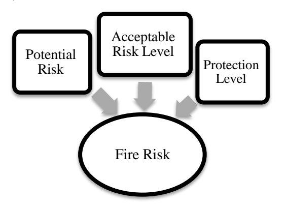
Fig. 1. The parameters affecting the calculation of fire risk levels in FRAME

method, the parameters were calculated such as the potential risk level, acceptable risk level and risk protection level for each risk. Finally, fire risk levels were calculated separately for the building and the contents (R), occupants (R1), and activities (R2). Figure 1 shows the effective parameters for risk level calculations. The important aspect in FRAME that can estimate the normal expected losses to build and contents based on the calculated fire risk level (Table 1)