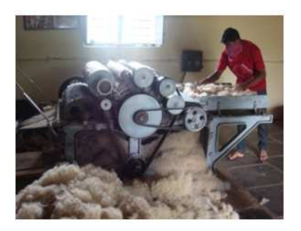
Figure 6: Pre-Carding of UAS Wool Fibres

The pre-carded UAS sheep breed wool fibres were blended with acrylic, r-PET and jute fibres in varied proportions viz. , 70/30, 60/40 and 50/50 by adopting sandwich blending technique. The pure and blended fibres were processed in woolen carding system (Figure 7). The pure and blended slivers were spun on hand charaka (Figure 8) at Medleri, Ranebennur taluk, Haveri district, Karnataka and friction machine (Figure 9) at Wool Research Association (WRA), Thane, Mumbai. The developed pure and blended yarns were subjected to yarn evenness test (Figure 10) using Uster Tester 4-SE at Gadag Co-operative Textile mill Ltd, Hulkoti. The statistical tool one-way ANOVA was used to draw valid conclusions.