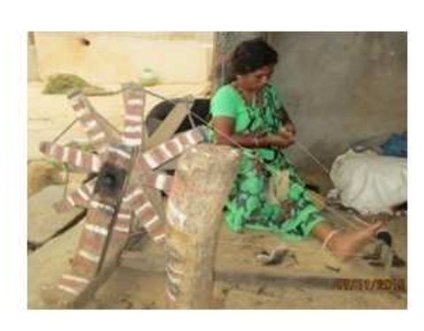
Figure 8: Hand Spinning of UAS Sheep Breed Wool Blended Yarns in Hand Charaka