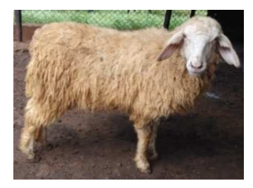
Figure 1: UAS sheep breed

Wool is highly valued for a wide range of properties which can absorb upto 30 % moisture to its own weight without feeling wet. Although not a very strong fibre, wool is highly extensible, flexible and resilient. These properties makes the wool fabrics better handle, drape and fashion style (Johnson and Russell, 2008). University of Agricultural Sciences (UAS) sheep breed wool developed by the UAS, Dharwad is shorter and coarser fibre. In the local area, the UAS sheep breed (Figure 1) is mainly reared for the purpose of meat and from each sheep 300 - 400 g of fleece is generated by every clipping per year. This type of wool is lacking proper value addition due to shorter, coarser and lower strength. The UAS sheep fleece can be improved through blending with other stronger natural and manmade fibers.