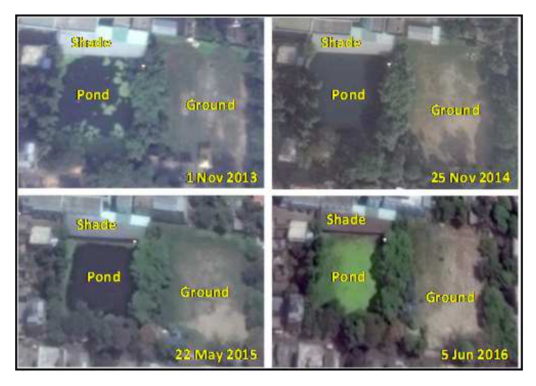
Figure 2: Multi-Temporal Satellite Imageries of Different Seasons Showing Pond, Play Ground and Shaded Area in Dinabandhu Andrews College Premises