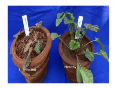
Figure 2: Pathogenicity Test of Collar Rot Pathogen on Gerbera (Var. Bellwater White)

Inoculation of 5 sclerotia of S.rolfsii in to the collar region of 30 days old healthy Gerbera variety Bellwater (White) expressed the typical symptoms within 7 days after inoculation. Infected plants showed typical rot in the collar portion with numerous brown, mustard seed like sclerotia, followed by blightening and girdling of the affected plants. The pathogen was re-isolated from the artificially inoculated plants and showed all the characteristic features of the original culture. Thus Koch's postulate was confirmed (Figure 2). Similar methodology was followed and proven pathogenicity in tomato plants by Xie et al. (2014).