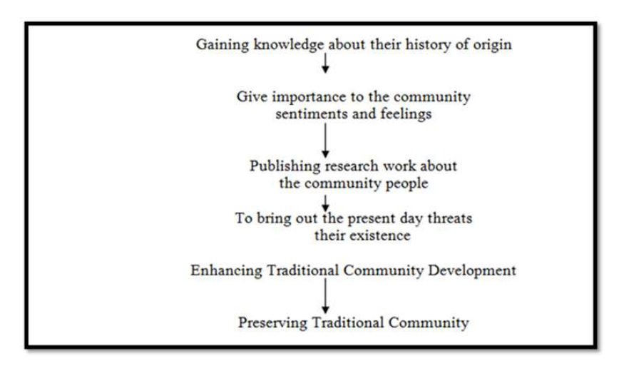
Figure 2: How to Preserve a Traditional Indigenous Community