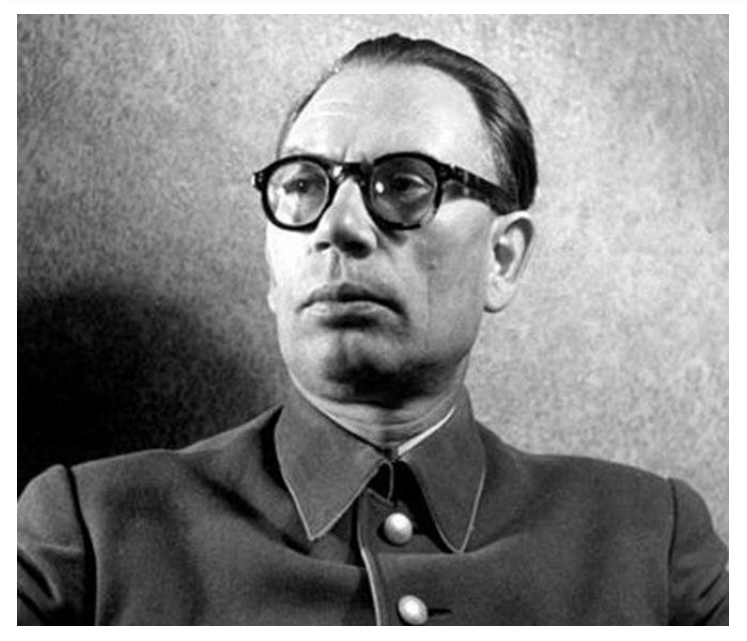
Fig. 2. General Andrey Vlasov