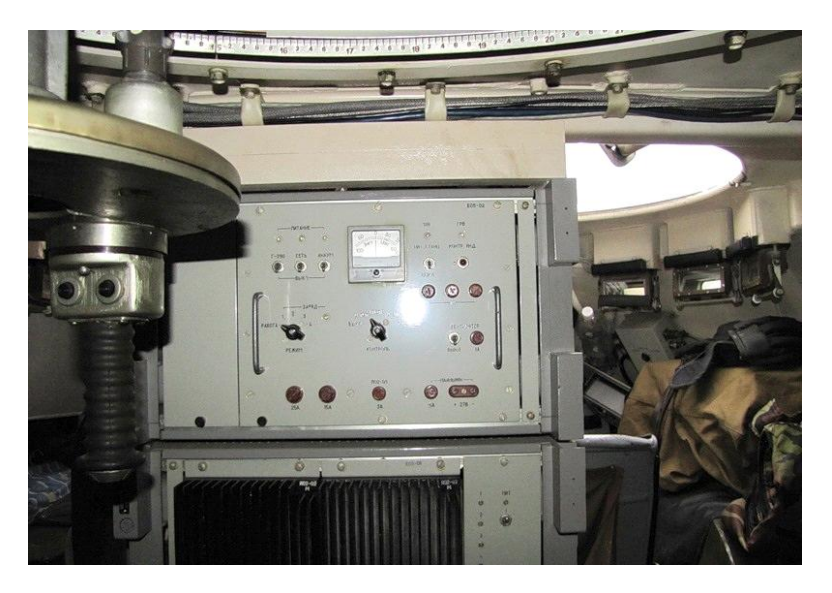
Fig. 5. Operating panel of ZS-82 ("The Decorator").