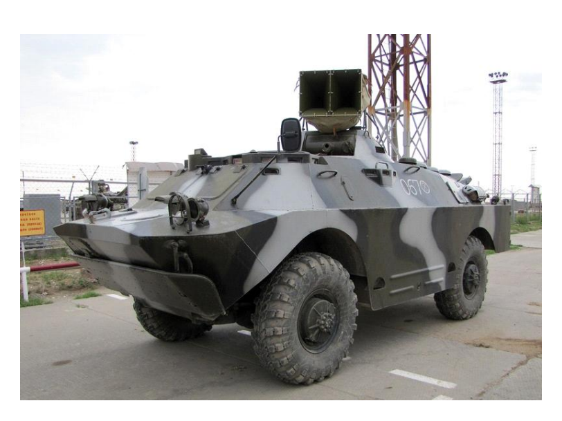
Fig. 1. ZS-82 ("The Decorator") left side view.

The operating range of 3C-82 ("the Decorator") is 6 km, capacity – 1000 Wt, and the operator, reading out the text, has the opportunity to be at a distance of up 500 meters from the armored vehicle with the device. This is the main propaganda weapon of modern Russian army, previously barely used. By using sound-amplifying equipment Russian officers in case of a military conflict can persuade the enemy to surrender (Russia settled...).