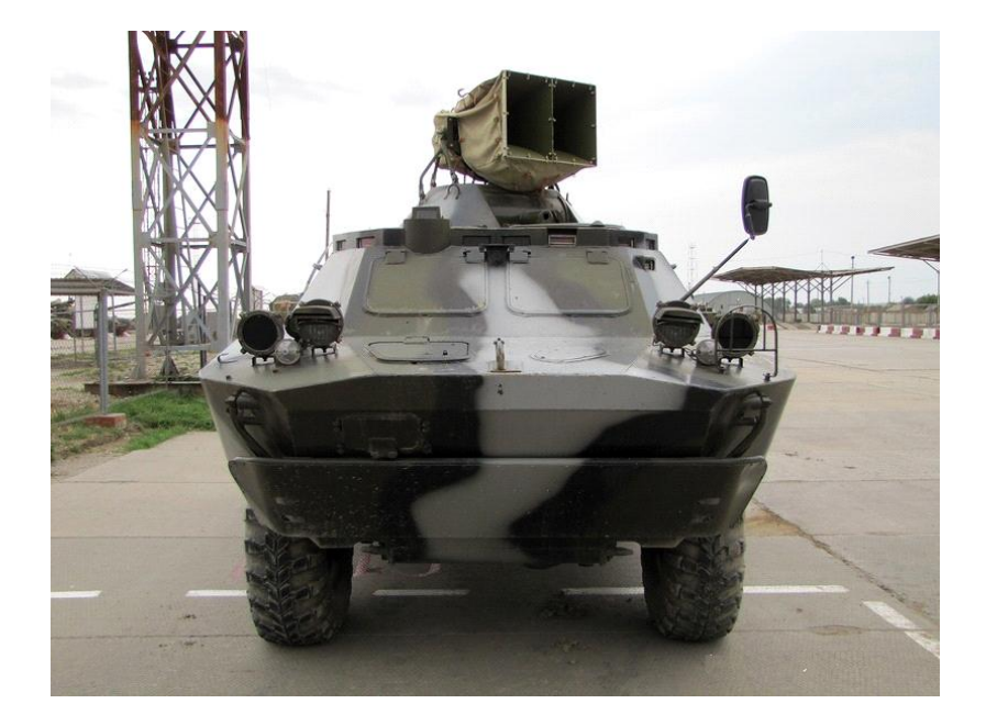
Fig. 2. ZS-82 front view.