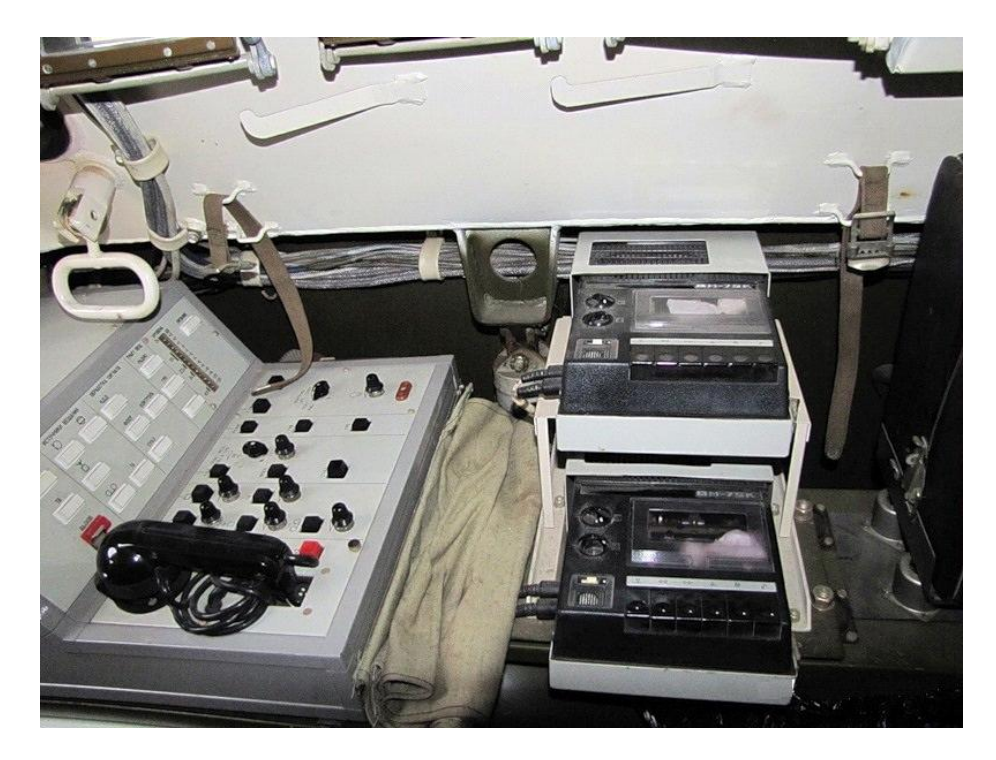
Fig. 4. Interior equipment, tape recorder.