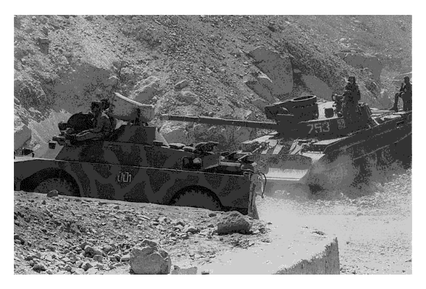
Fig. 6. ZS-72b in a convoy in Afghanistan.

According to available data, an earlier version of the sound broadcasting station – ZS-72b in 1980 was in service of agitation troops (later – psychological action troops), 10 in number (1 for the border area and a group of troops) (Schüschpanzers are in attack). It was used in combat operations in Afghanistan by the agitation units of the 40th army.