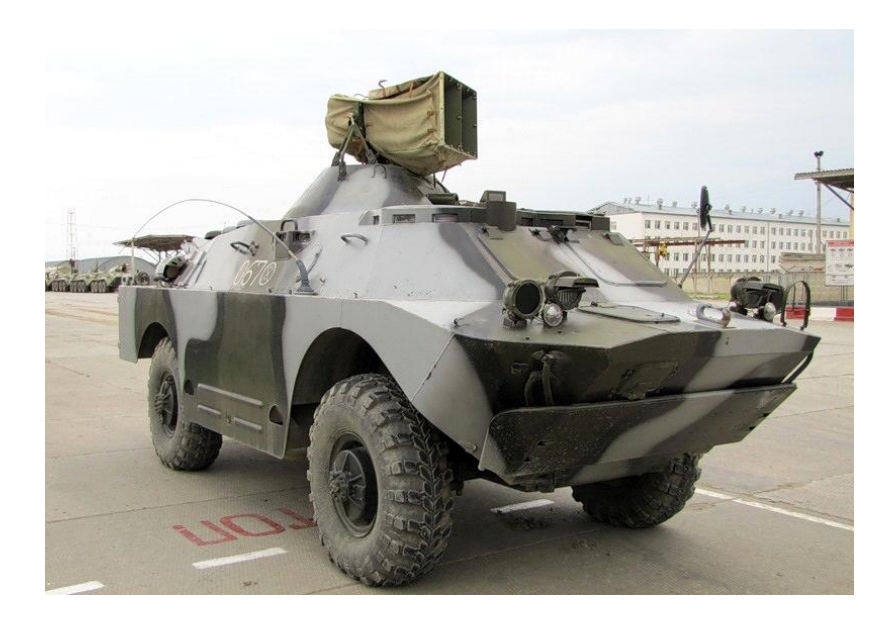
Fig. 3. ZS-82 ("The Decorator") right side view.

ZS-82 ("The Decorator") standard equipment set: