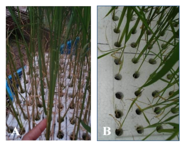
Figure 3. Drought and salinity tolerant realated mutant phenotypes observed. A. Salinity tolerant and B. Salinity sensitive.

Excess salts adversely affect all major metabolic activities in rice including cell wall damage, plasmolysis, cytoplasmic lysis and damage to ER, reduction in photosynthesis, and overall decline in germination and seedling growth (Pareek et al., 1997; Sivakumar et al., 1998). The condition will ultimately lead to reduced growth and diminished grain yield. Rice is considered as more sensitive to salts stress during early seedling than at reproductive stages (Flowers & Yeo, 1981; Lutts et al., 1995). Therefore, observation of the effect of salt on rice during seedling stage will give desirable results. Some mutants exhibiting salt stress responses obtained includes salt tolerant (Figure 3A) and sensitive(Figure 3B) mutants.