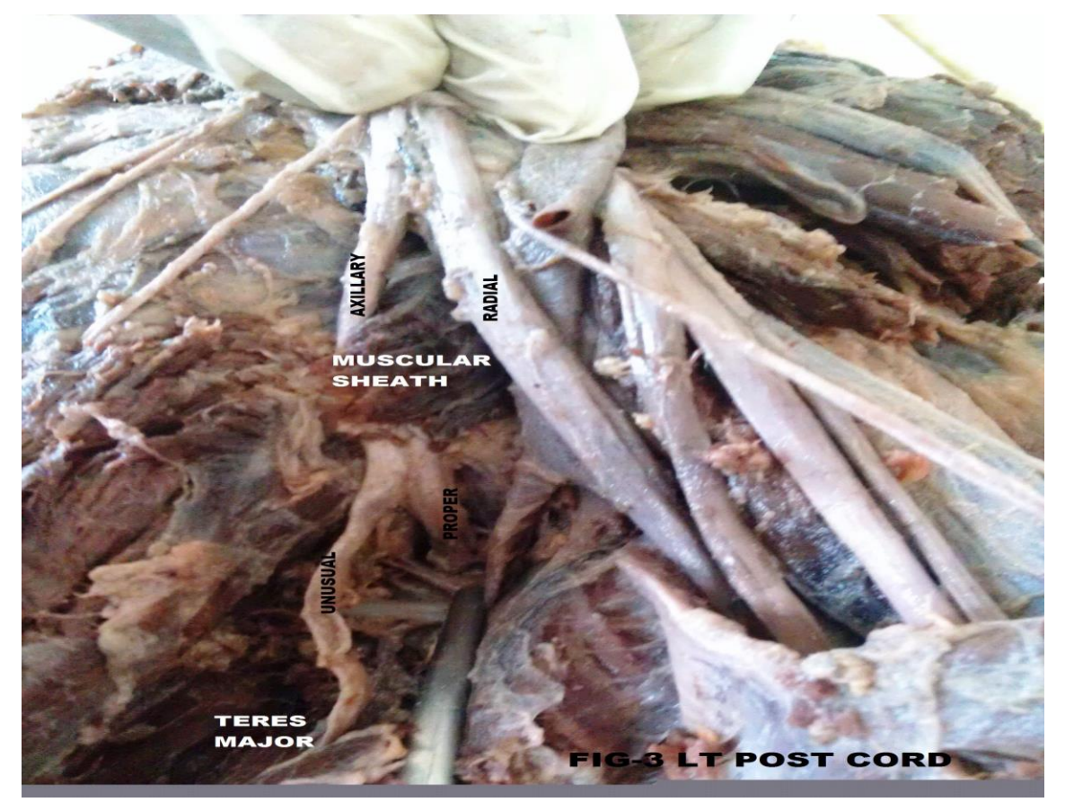
Figure 3: Deep Dissection