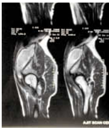
Figure 1. MRI of Hip Joint showing presence of haematoma in the left iliacus muscle in the left iliac fossa extending up to iliopsoas insertion in the lesser tronchanter.