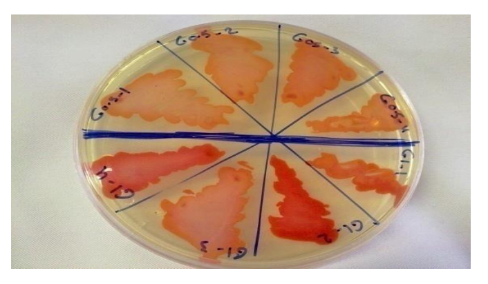
Fig 4. Different mutant isolates of Serratia grown on medium contains gentamycin.

Gentamycin antibiotic was mixed with nutrient agar media to produce spontaneous mutants from wild (Fig 4).