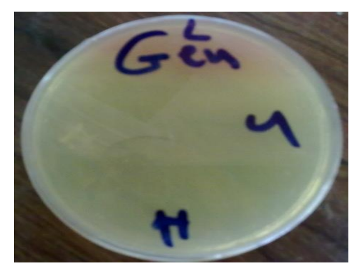
Fig 2. Gradient plate inoculated with S. marcescens and incubated for 37°C for 24 h.

This medium was used for isolation bacterial mutant of different antibiotics. Two hundred of overnight broth medium was transferred to nutrient agar gradient plates, spread by sterilized spreader carefully, Incubated at 37°C for 24 h. The growth of bacteria was examined according to action of antibiotic concentration on gradient plates ( Fig 2 ).