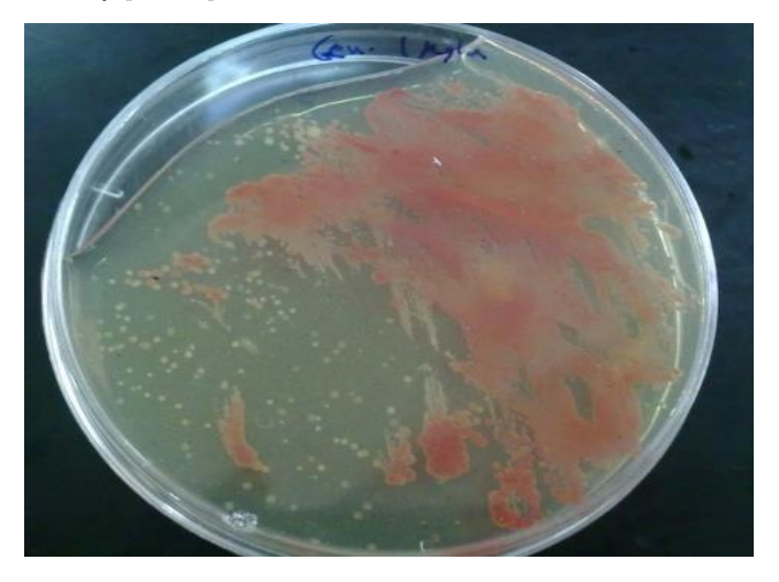
Fig 1. S. marcescens isolate wild produced prodigiosin attributed with red pigment.

medium was mixed with antibiotic solution at 40 °C and poured in sterilized plates (for gradient plates and selective plates) and incubated for 24 h to insure the sterility [10-12].