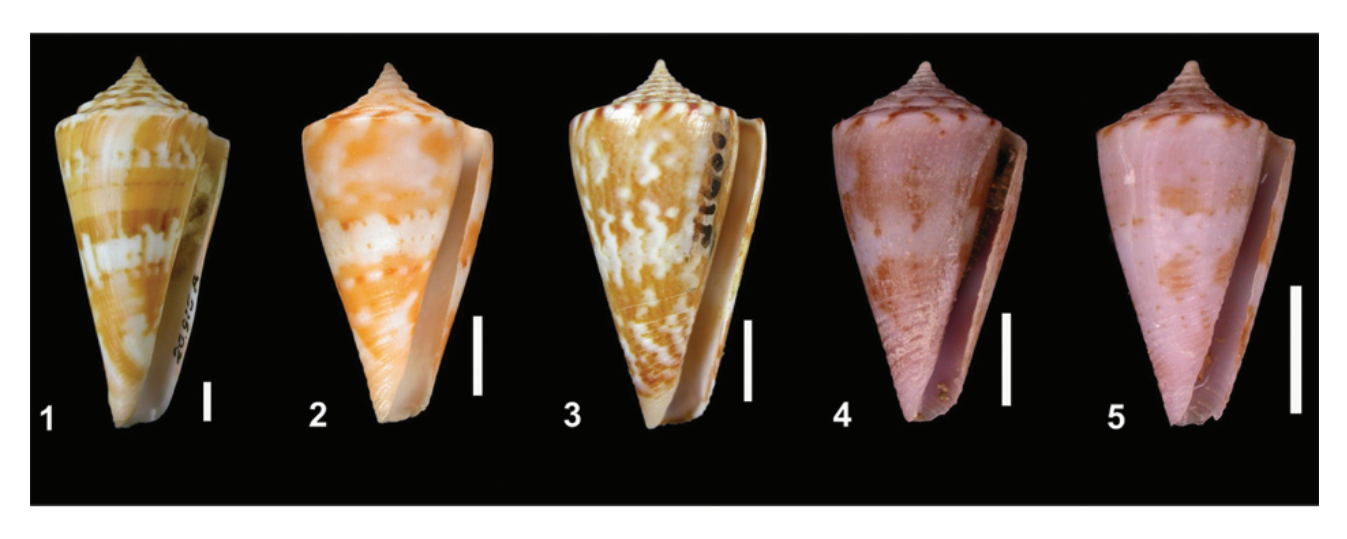
Figure 1, Conus carioca . Holotype MORG 20915a: 51.7 x 24.0mm, scale bar: 0,5cm; Figure 2: Conus sanderi . Holotype ZMUA 137055: 21,1mm; Figure 3: C. sanderi MORG 21600:21,3mm; Figure 4: C. sanderi MNRJ 13757: 19,6mm; Figure 5: C. sanderi MNRJ 13759: 15,0mm. Scale bar: 0,5cm.

Type material: Holotype: MORG 20915a. 51.7 x 24.0mm (Fig. 1).