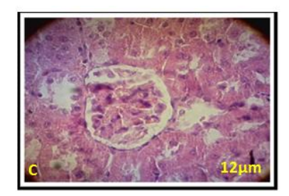
Fig.1: Kidney paraffin sections stained by haematoxylin and eosin (H&E) for histopathological changes. Control and GTE group ( A ) showing intact histological structure. Pb-treated group ( B ) showing swelling and vacuolization in the endothelial cells lining the tuft of the glomeruli (g) with fibrosis (f) and hyalinosis (h) between the tubules in focal manner and inflammatory cells infiltration (m) and few fibroblastic cells proliferation (arrow) in between the degenerated tubules (d) in focal manner at the corticomedullary portion Kidney ( C ) GTE+Pb shows the architecture nearto normal (x 200).