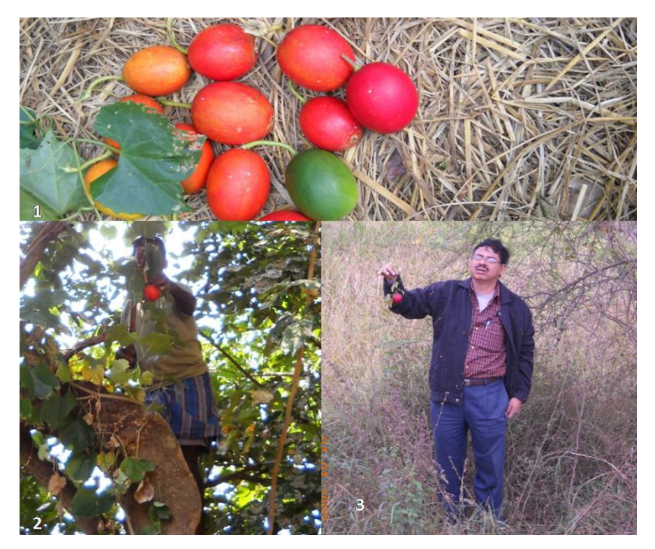
Plate 1: Collection of Plant materials, 1: Fruits of T. tricuspidata, 2: Collection of fruits at Similipal Biosphere Reserve, 3: Collection of ripen fruits at Hatibadi village