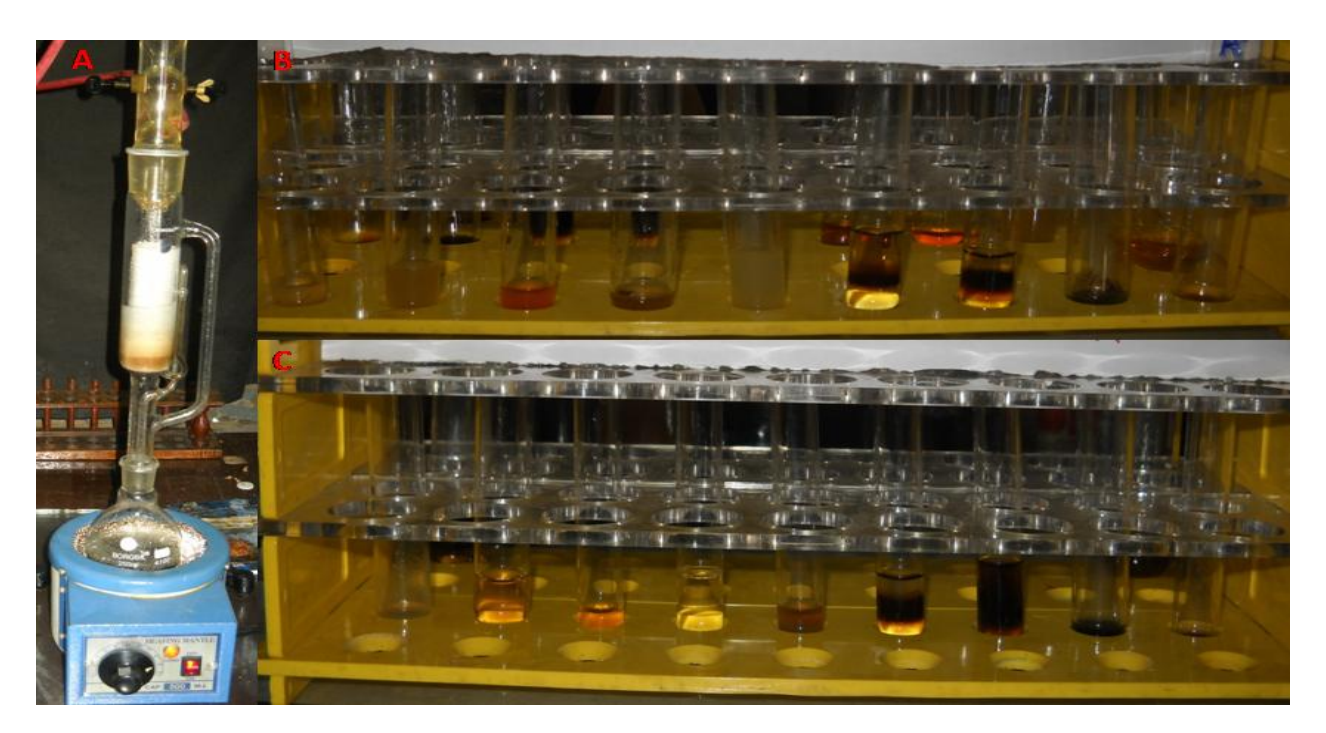
Plate 2: Extract preparation and qualitative estimation of bioactive compounds present in fruit extracts