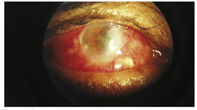
Figure 1. Corneal ulceration beginning to develop on the nasal side.