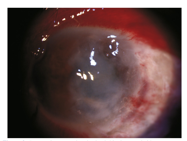
Figure 3. Progressive corneal and scleral thinning nasal side.

reduction in corneal sensation. Thus, we added ointment acyclovir to our previous treatment regimen. Soon after, a rapid clinical improvement was noted (Figure 5). Areas of scleral thinning and corneal ulceration started to resolve with fibrosis and conjunctivalization of the thinned out sclera. Subsequently, his clinical course was otherwise uncomplicated and a steady resolution of the ulcer also occurred (Figure 6). His final visual outcome was 6/60 with preservation of the ocular structural integrity.