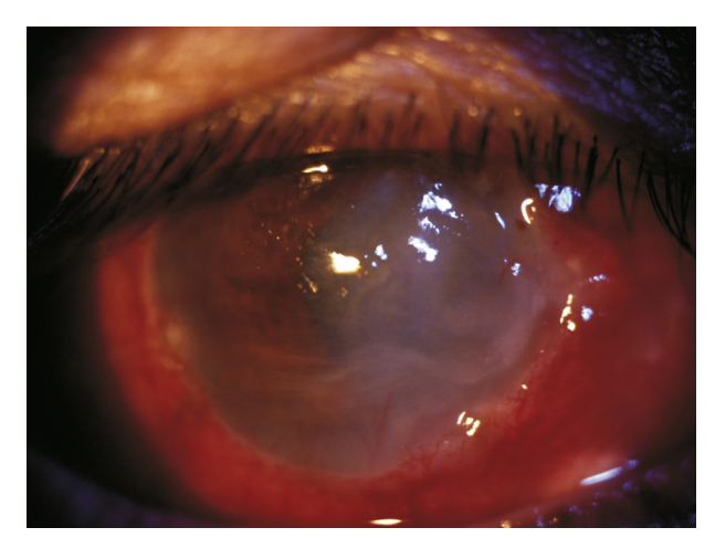
Figure 6. Post treatment resolution with residual scarring.