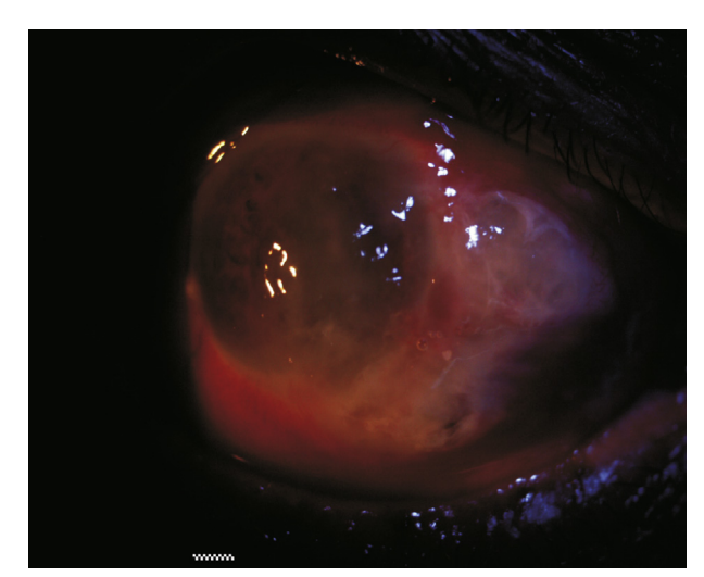
Figure 4. Impending perforation.

reduction in corneal sensation. Thus, we added ointment acyclovir to our previous treatment regimen. Soon after, a rapid clinical improvement was noted (Figure 5). Areas of scleral thinning and corneal ulceration started to resolve with fibrosis and conjunctivalization of the thinned out sclera. Subsequently, his clinical course was otherwise uncomplicated and a steady resolution of the ulcer also occurred (Figure 6). His final visual outcome was 6/60 with preservation of the ocular structural integrity.