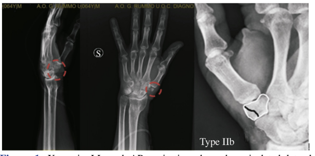
Figure 1. X-ray in LL and AP projection showed an isolated lateral fragment dislocation fracture of the trapezium. The third images from the left is an representation of Walker's type IIb (Classification of Trapezial fracture)<sup>[4]</sup>.