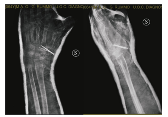
Figure 3. X-ray in the brace (AP and LL projections) after surgery showed the correct redaction of the trapezial fracture.

Five days after the injury, we did the surgery to his trapezial fracture. A percutaneous approach was decided under general anaesthesia. The definitive fixation reached three 1.1 mm Kirschner wires (Figure 3).