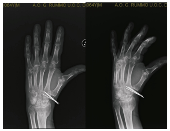
Figure 4. X-ray at the 5th postoperative week, before removing the Kirschner wires. The fracture was consolidated and the joint surface between trapezium and the 1st metacarpal was smoothed anatomically.

After the 5th week from the surgery, the three 1.1 mm Kirschner wires and cast were removed because the X-ray showed that all were well positioned (Figure 4).