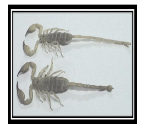
Figure 3. A photo illustration of male and female H. lepturus (Prepared by MH Pipelzadeh et al ).

As far as we know, no study exists to survey the situation of scorpionism in Gotvand County, Khuzestan province, Iran. This study was conducted to determine the epidemiology of scorpion stings in this region. These data are important for the control of stinging by scorpions.