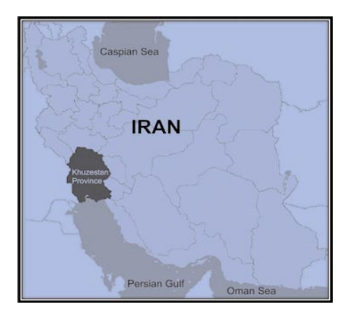
Figure 2. Map of IRAN Provinces, the Khuzestan Province displayed in black color (Prepared by National Geosciences Database of IRAN).