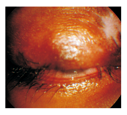
Figure 3. Right complete ptosis.

The conjunctiva was injected and chemosed. Corneal sensation in the right eye was absent, and the cornea had a central ulcer measuring 7.6~\text{mm} \times 7.6~\text{mm} in diameter. The anterior chamber had cells and an associated hypopyon. The intraocular pressure was 28~mmHg in the right eye and 10~mmHg in the left eye. The left fundus was normal. There was no view of the right fundus. Ultrasound B—scan of the right eye revealed a flat retina with clear vitreous.