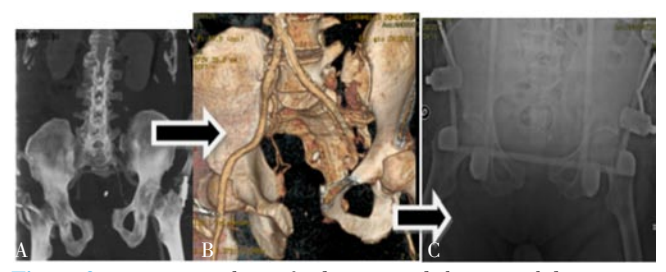
Figure 3. CT, 3D CT and XR of pelvic vertical shear instability. A: CT; B: 3D CT; C: XR showing the reduction of pelvic vertical shear instability by APEFF.