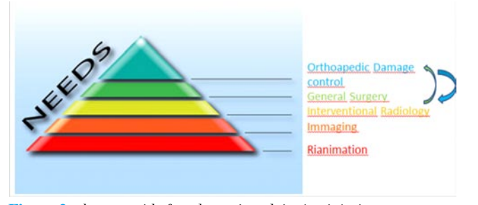
Figure 2. The pyramid of total care in pelvic ring injuries.

Upon admission to the emergency room the patients had an average glasgow coma score of 12.5 points (range 8–15) (Table 2). We performed the initial emergency orthopedic treatments according an algorithm<sup>[4]</sup> and pyramid of total care (Figures 1 and 2). A total of 439 patients (83.47%) were hemodynamic stable, while 87 (16.53%) unstable. The 87 pathients were treated by packing in 24 cases (4.56%) and angio-embolization in 63 patients (11.98%) (Table 2).