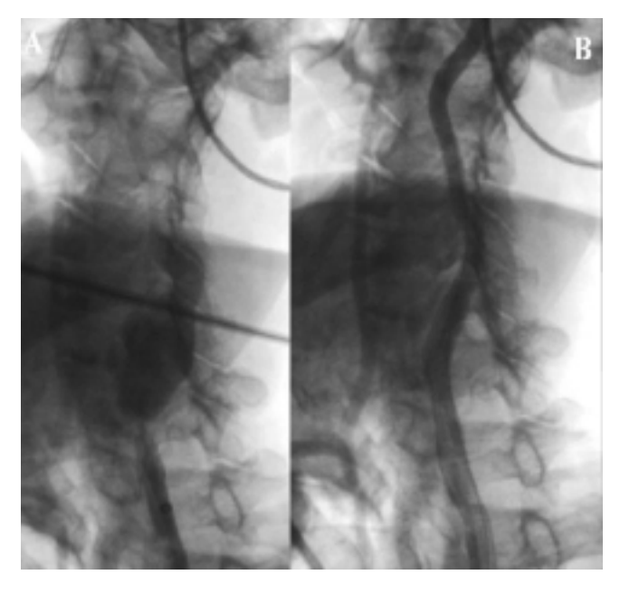
Figure 2. Intraoperative angiography: selective study (A) of the pseudoaneurysm, and final control after SG deployment (B) with the complete exclusion of the lesion.