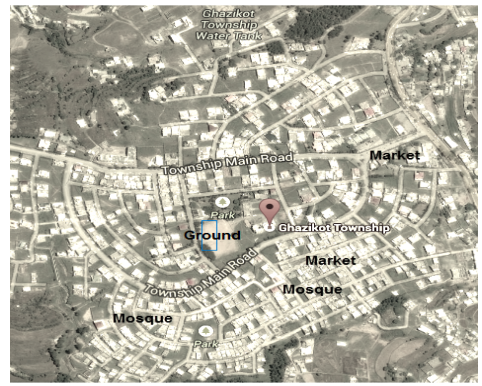
Fig 1: Aerial photograph of Ghazikot Township, Mansehra where breeding characteristics of House crow eggs were studied.

not yet constructed. Study area serviced by an extensive road networks with plantation at the road edges, comprises middle-class homes, as well as mosques, hospitals, schools and colleges, markets and public parks shown in (Fig. 1). Climate of the area is severe i.e. hot in summer up to 40 °C and 5 °C in winter (SMEDA <sup>[29]</sup>). Main vegetation of the study area consists of Populus euphratica, Platanus orientalis, Pinus roxburgii, Melia azedarach, Eucalyptus camaldulensis, Broussonetica paperfera, Acasia nilotica and many other fruit as well as ornamental plants.