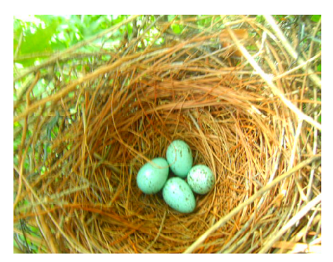
Fig 3: One of clutch of House crow with 4 eggs.