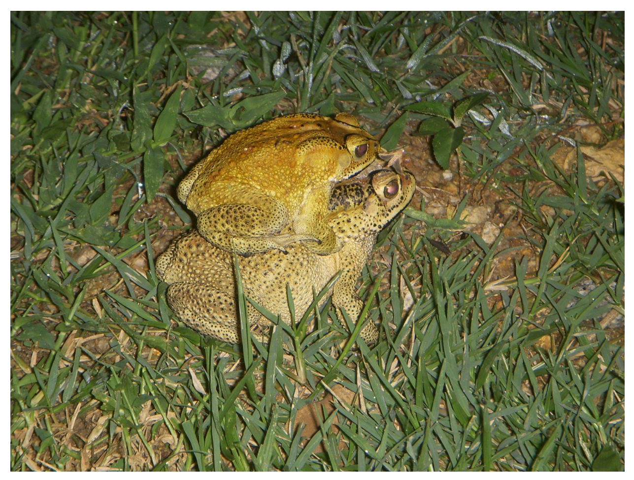
Fig 1: A photograph showing male and female melanostictus species.

of Marburg, Germany, and coworkers (2004) that the fat-tailed dwarf lemur of Madagascar hibernates in tree holes for seven months of the year. However, very few studies have been performed to focus the biology of hibernation. Indian common toad, Duttaphrynus melanostictus is known to be a very good hibernator. This toad is very common in India and is available in plenty in natural habitat during summer, but is found to be hibernating in mud holes and corner of the rooms during winter.